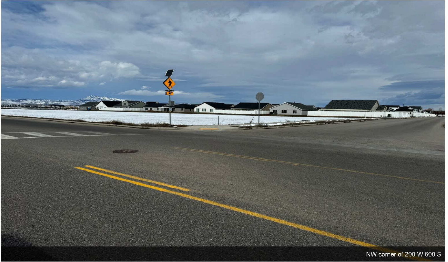
NW corner of 200 W 600 S