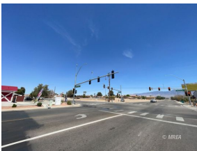
From opposite corner