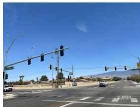
From opposite corner