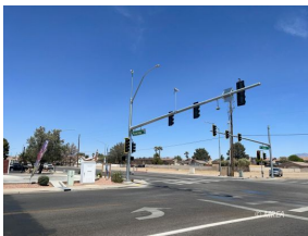
From opposite corner