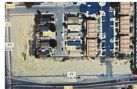
aerial with dimensions of frontage