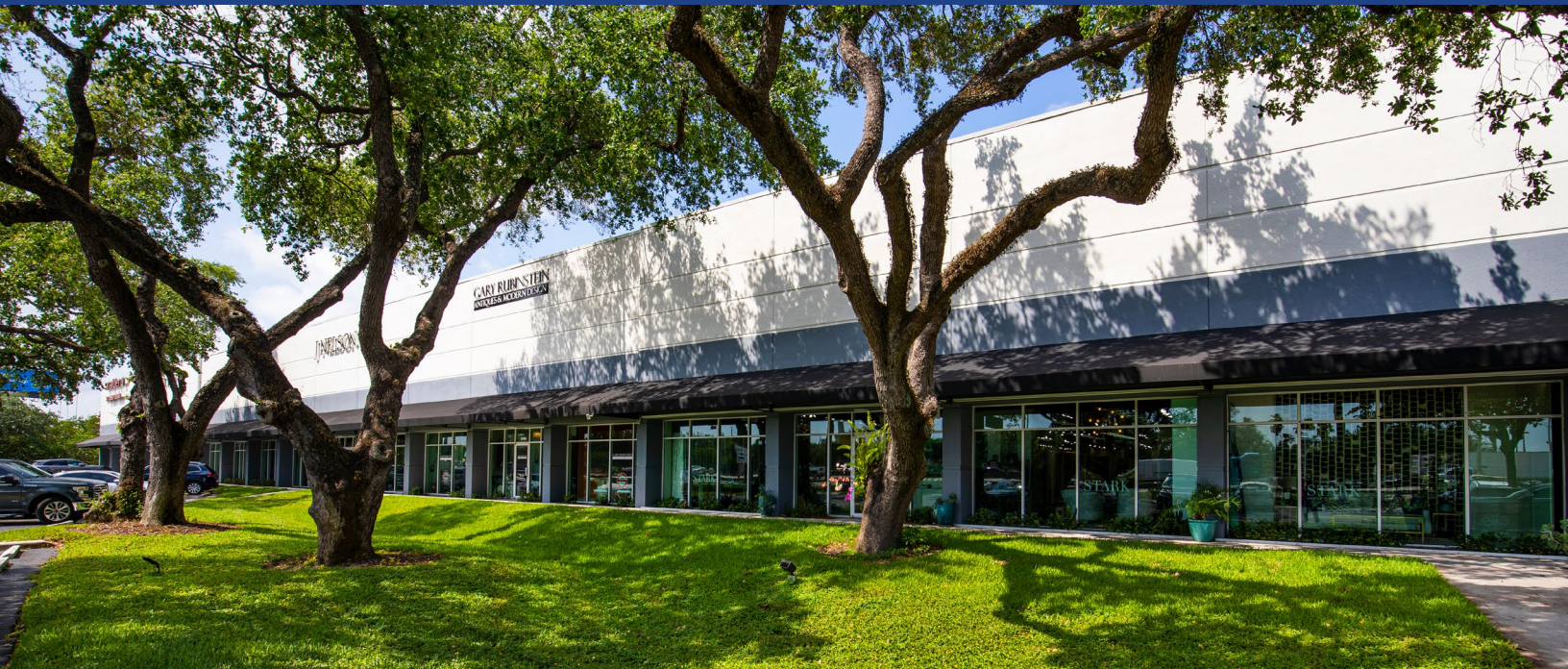
Amazing Location to Lease