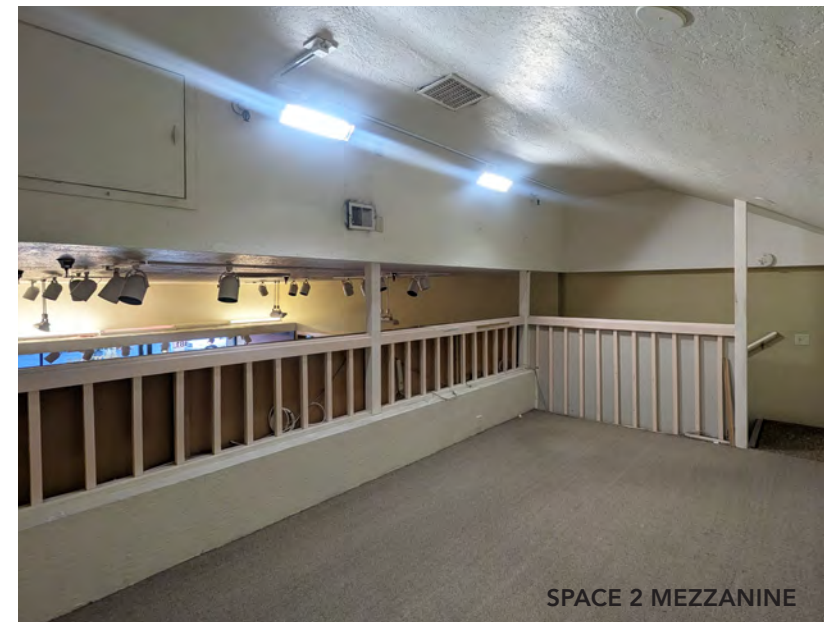
SPACE 2 MEZZANINE

The information in this package was gathered from sources deemed reliable, however Evans, Elder, Brown & Seubert makes no representation or warranty of the accuracy of the information. Any buyer or tenant considering a purchase or lease of this property should confirm any and all information relied upon in making the decision to purchase or lease prior to finalizing the transaction and bears the risk of all inaccuracies.