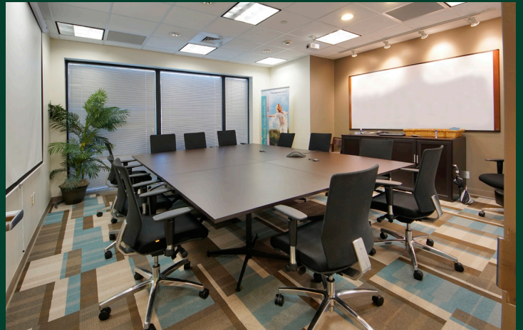
Suite 100 Conference Room