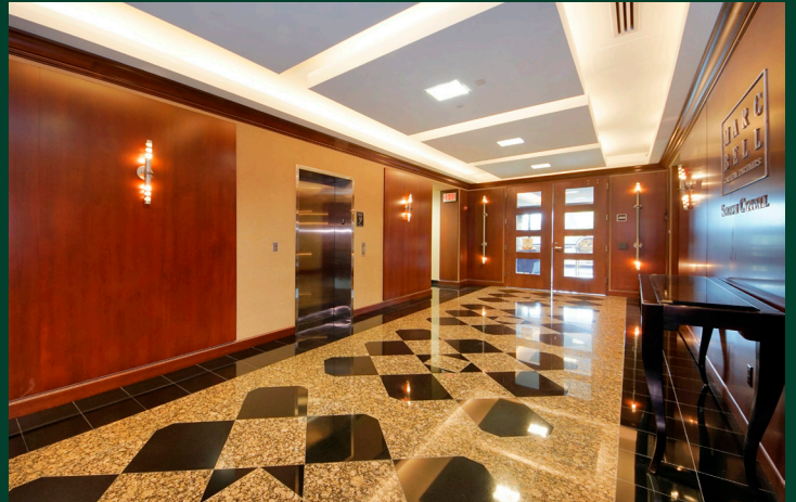
2nd Floor Lobby