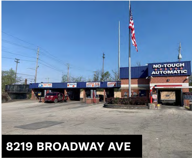
8219 BROADWAY AVE

ADDITIONAL CAR WASHES AVAILABLE INDIVIDUALLY OR AS A PORTFOLIO: