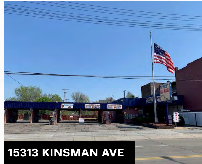
15313 KINSMAN AVE