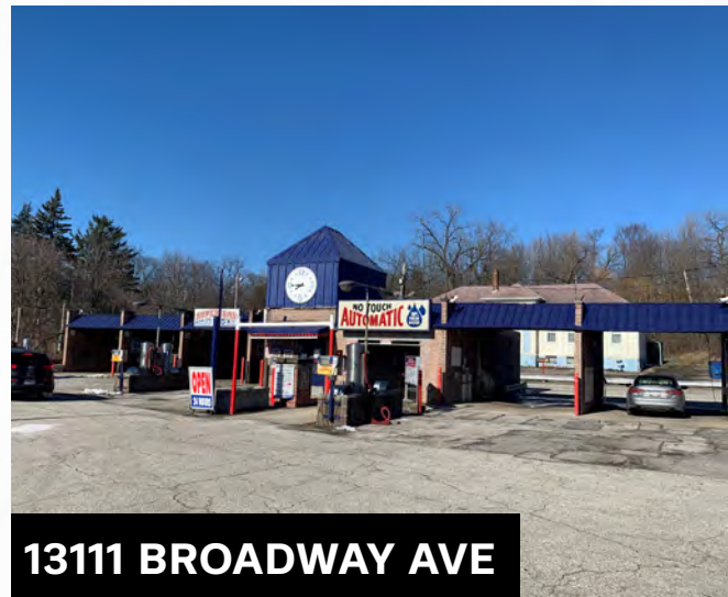
13111 BROADWAY AVE