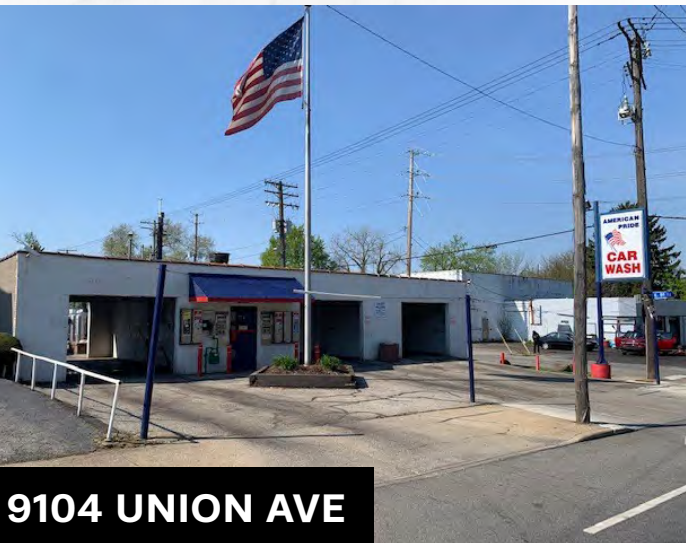
9104 UNION AVE