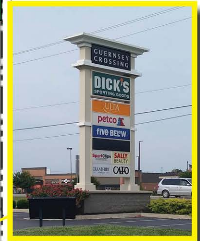
Pylon Signage Overall Height 30 Feet

4901 Hunt Road, Suite 102 | Blue Ash, OH 45242 513-784-1106 | www.anchor-associates.com