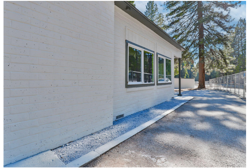
Side of Residence