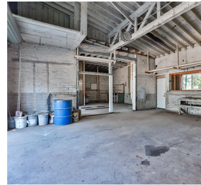
Previous Gas and Service Station