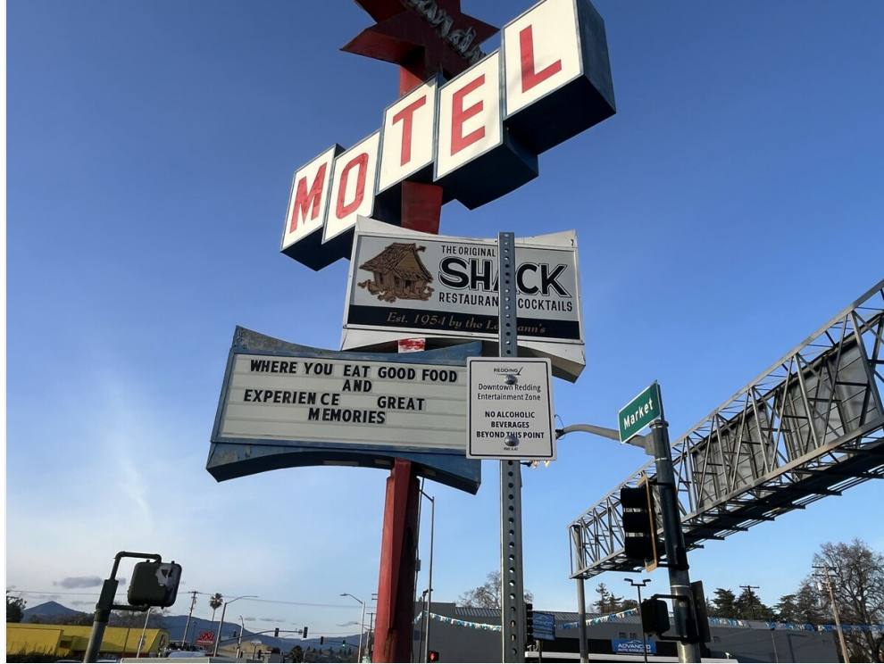
Entertainment Zone 1