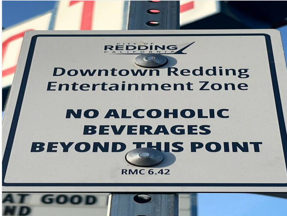
Entertainment Zone 2