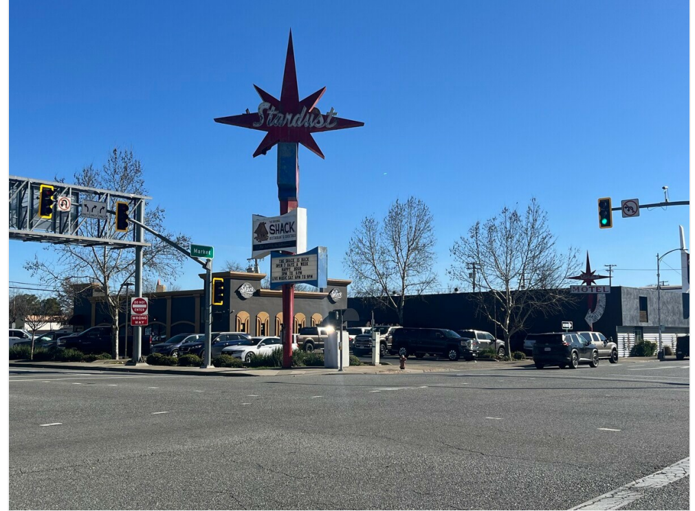
1201 Market Street Redding 1