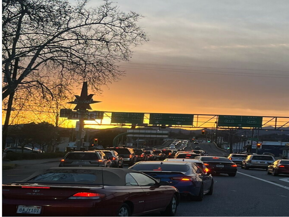
Entertainment Zone 4