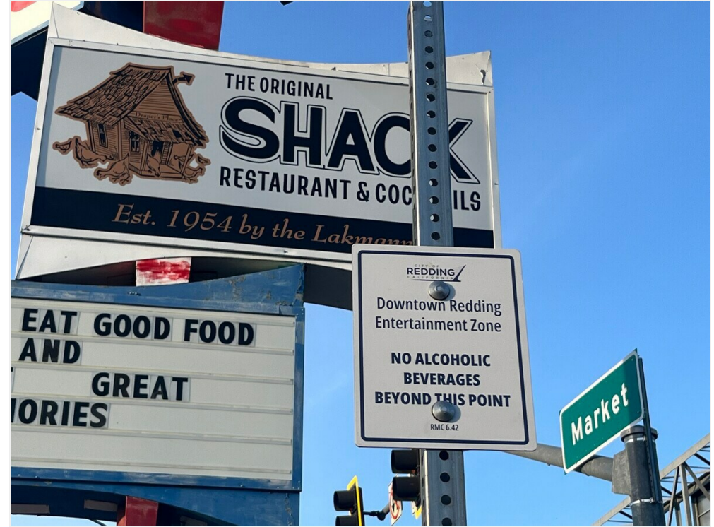
Entertainment Zone 3