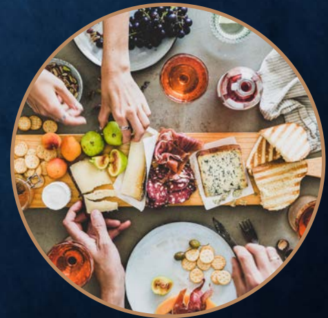
Foodie Destination: Atwater Village has been praised as a go-to destination for food lovers by several media outlets, including LA Times, Discover LA and Eater LA.