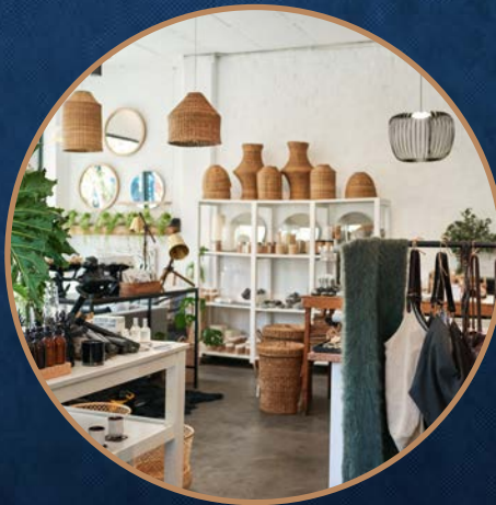
Discover Something New: Eclectic shops sell everything from home décor to books and vinyl.