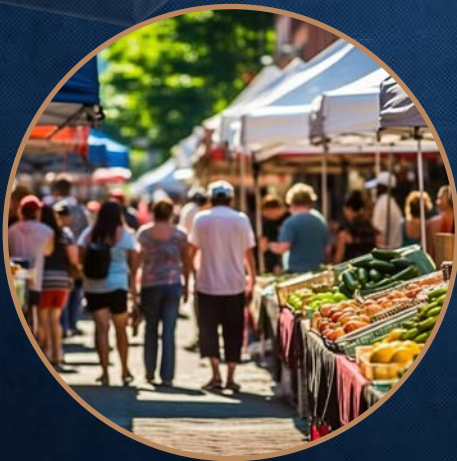
Every Sunday Rain or Shine: Farmers' Market brings foot traffic to area adjacent to space.

Atwater Village is a vibrant neighborhood located in the City of Los Angeles, bordered by the notable and gentrified communities of Los Feliz and Silver Lake. The area is home to an eclectic mix of historic landmarks, modern shops and trendy cafes. With easy access to both the 5 and 2 Freeways, the subject property is perfectly situated for those who want to be in the heart of the action. Glendale Blvd. is quickly transforming into a trendy, pedestrian-oriented retail and restaurant destination.