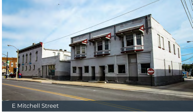
E Mitchell Street