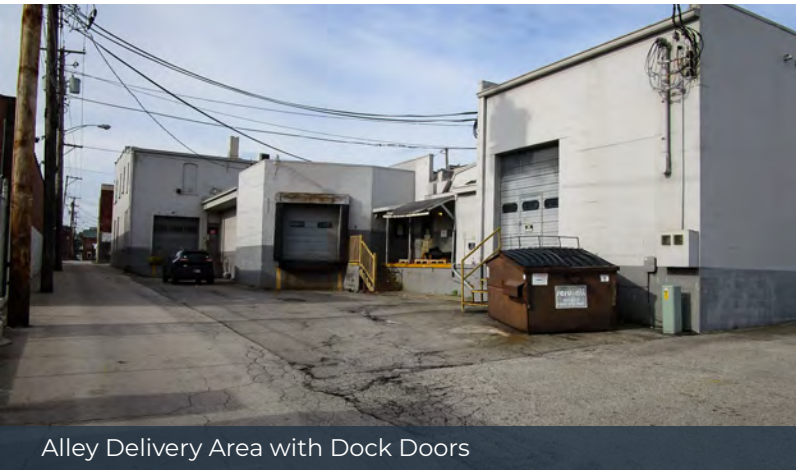
Alley Delivery Area with Dock Doors