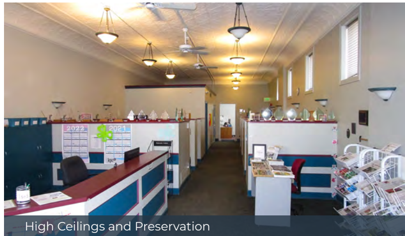
High Ceilings and Preservation