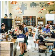
Mercantile Dining & Provision