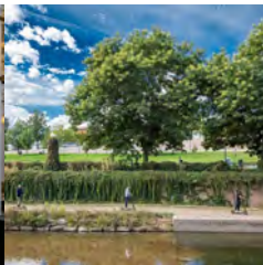
Cherry Creek Bike Path