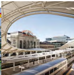
A Line to Denver International Airport