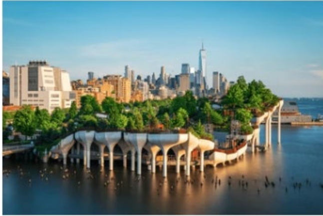
Hudson River Park / Little Island

NEIGHBORHOOD HIGHLIGHTS ATTRACTING MILLIONS OF LOCALS AND TOURISTS