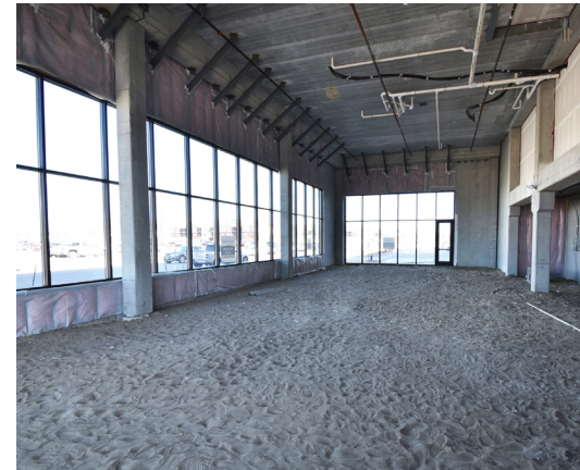
Lyv at Uptown & Main | Customizable Interior