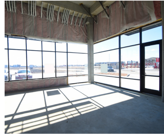
Lyv at Uptown & Main | Customizable Interior