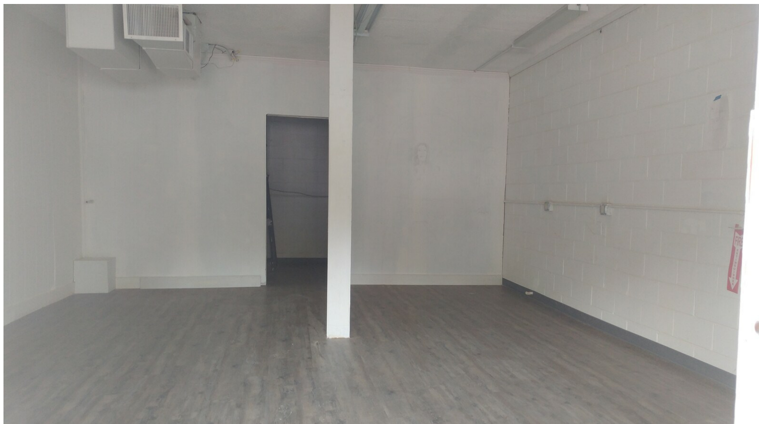
View when formerly painted white