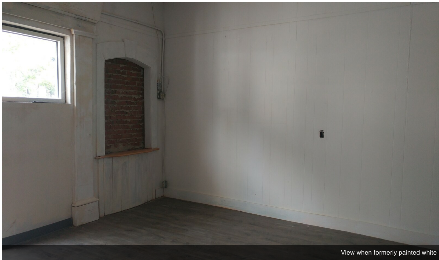
View when formerly painted white