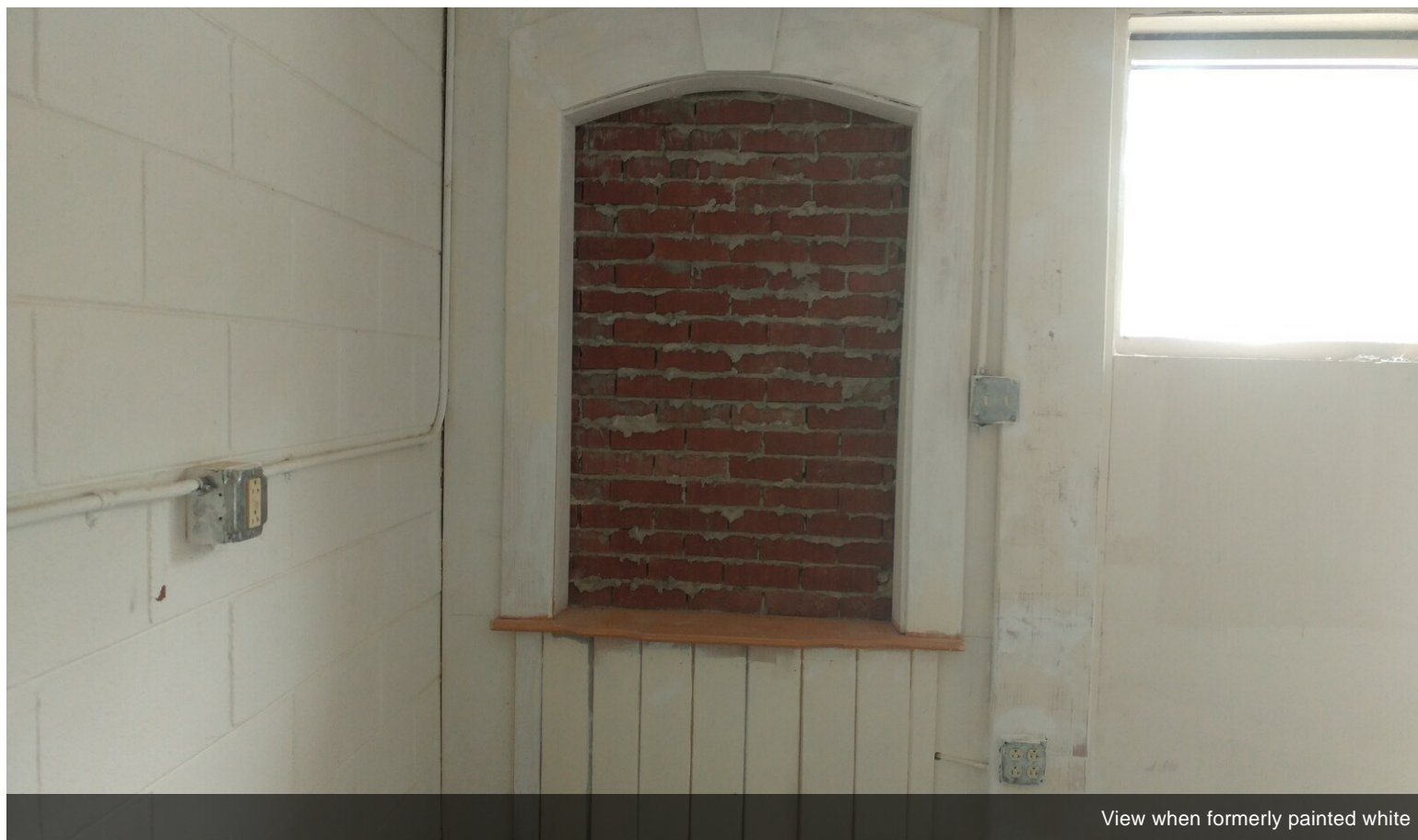
View when formerly painted white