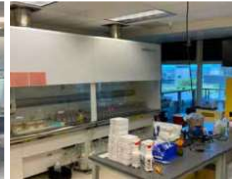
General lab space