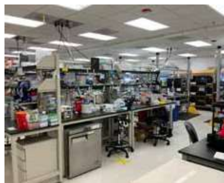
2 BSL2 laboratories