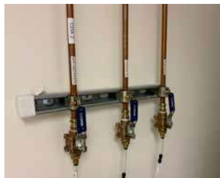
Clean, dry air; Nitrogen and Oxygen