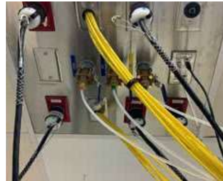
Ceiling service panels/e-power