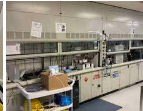
6 fume hoods