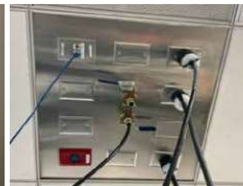
Ceiling service panels