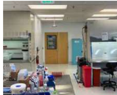
General lab space