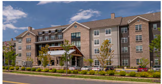
Tribute at Melford Town Center

For more information on the residential component at Melford Town Center, visit: MelfordTownCenter.com