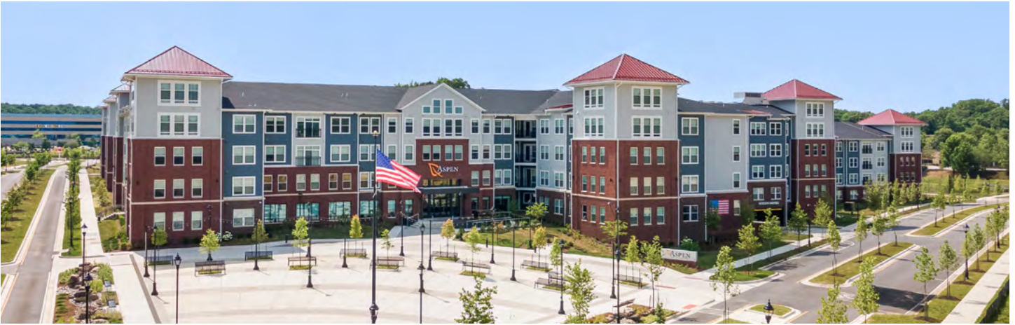
Aspen at Melford Town Center: Now Open