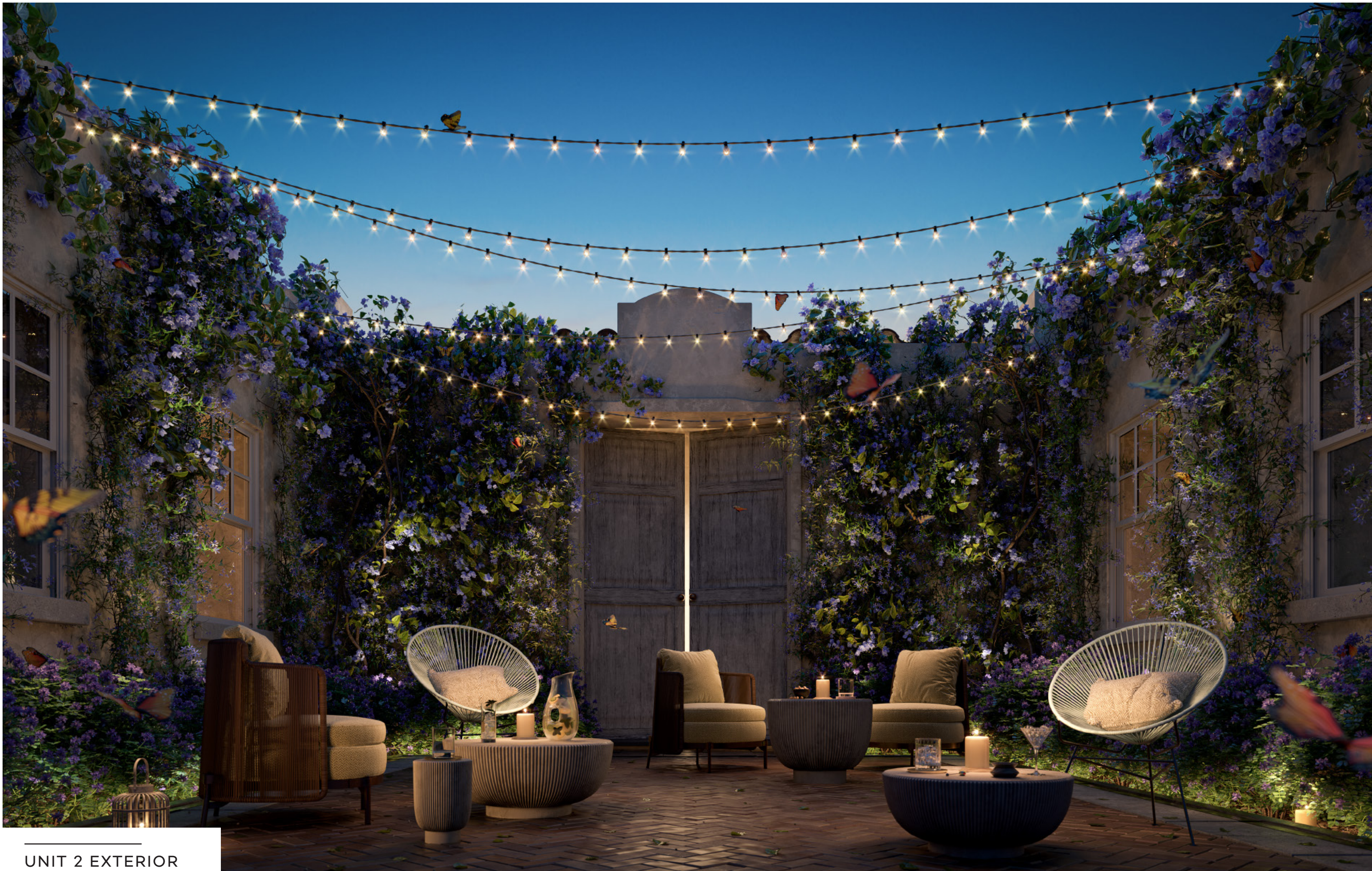
UNIT 2 EXTERIOR