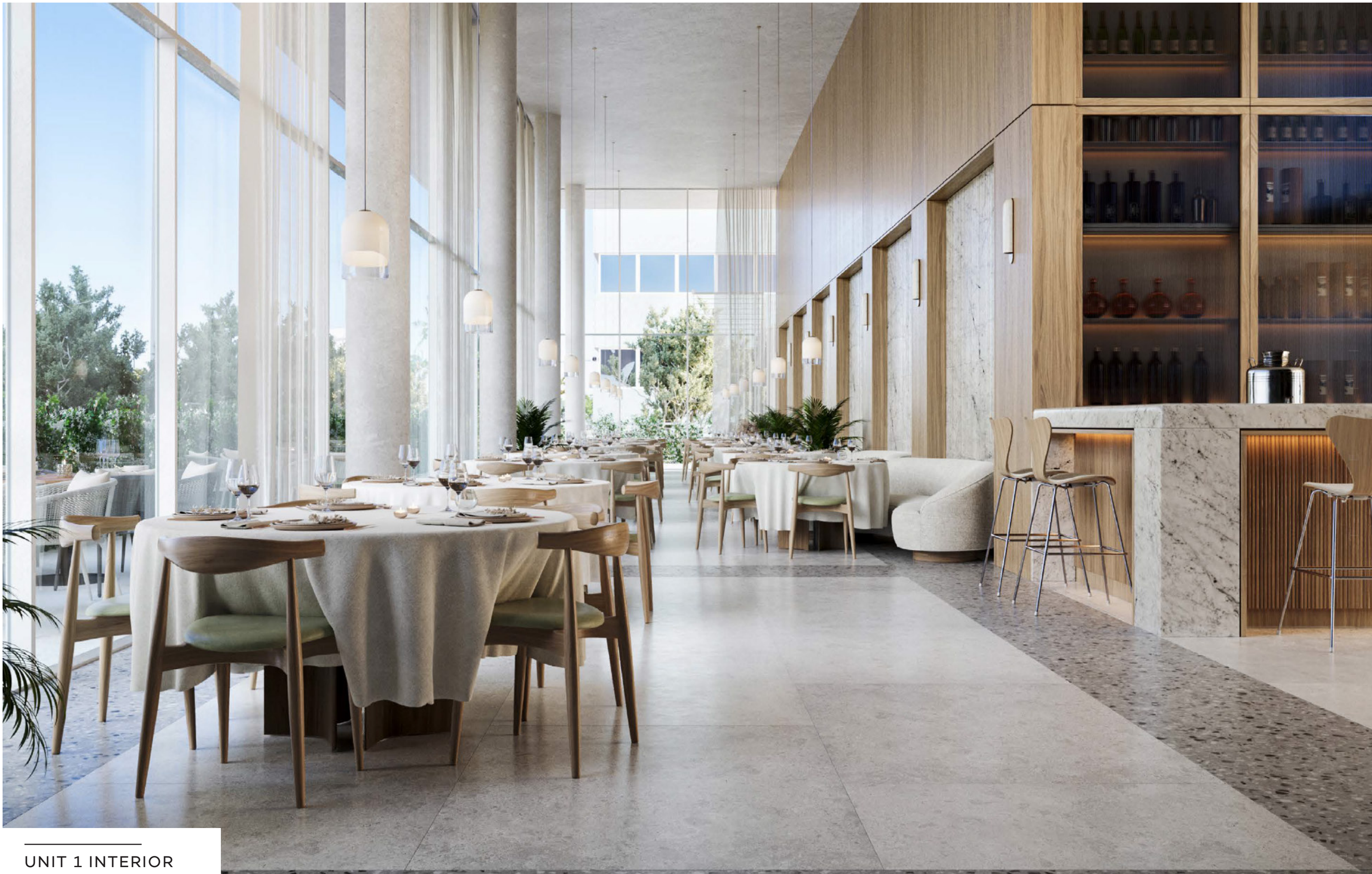
UNIT 1 INTERIOR