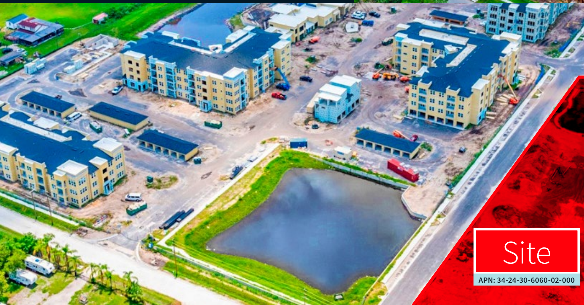
Site APN: 34-24-30-6060-02-000

From 2024 to 2029, the surrounding 5-minute drive-time population will surge by 12.45 percent in total, by far exceeding the national average.