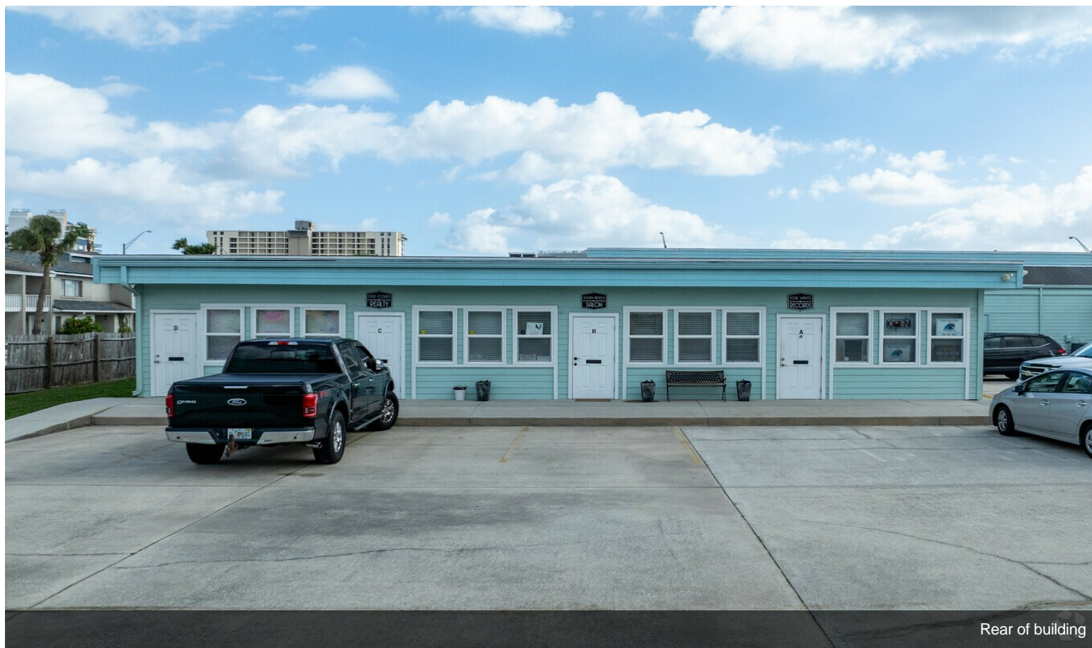
Rear of building