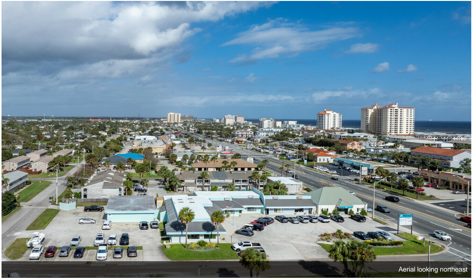
Aerial looking northeast