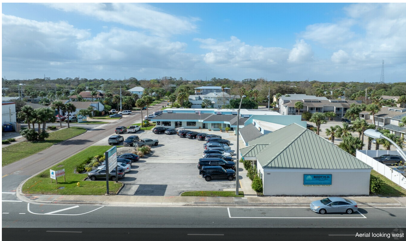
Aerial looking west