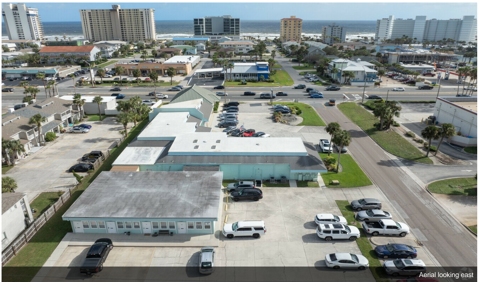
Aerial looking east