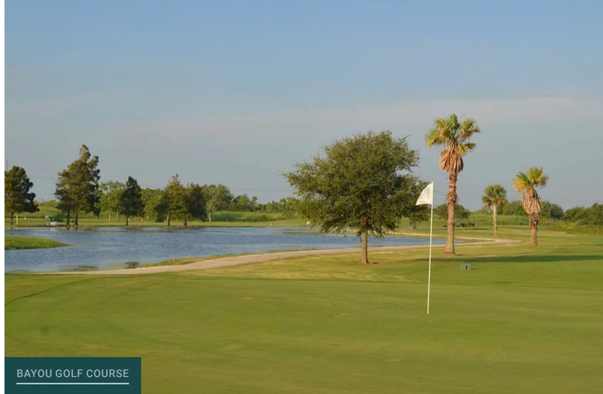
BAYOU GOLF COURSE