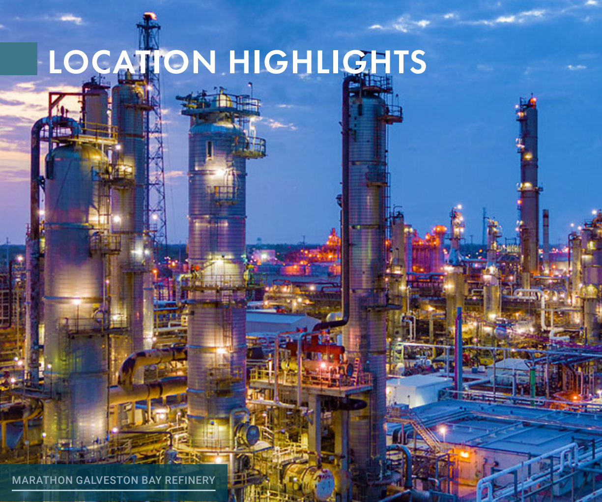
MARATHON GALVESTON BAY REFINERY