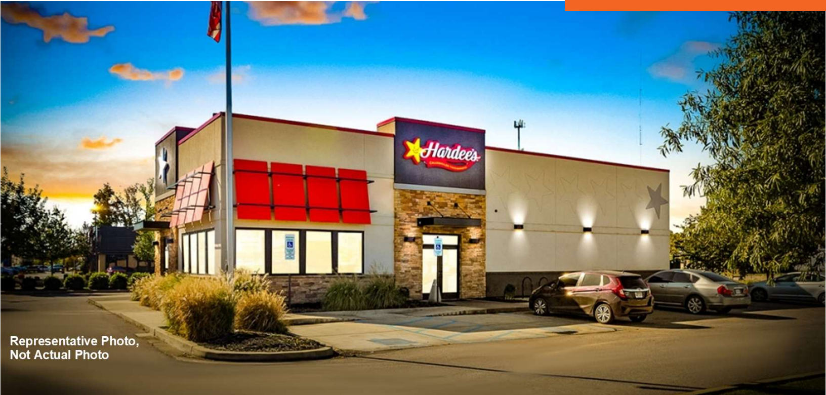
Representative Photo, Not Actual Photo