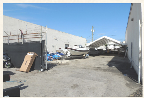
CENTER OUTSIDE YARD 35 FEET WIDE X 82 FEET DEEP