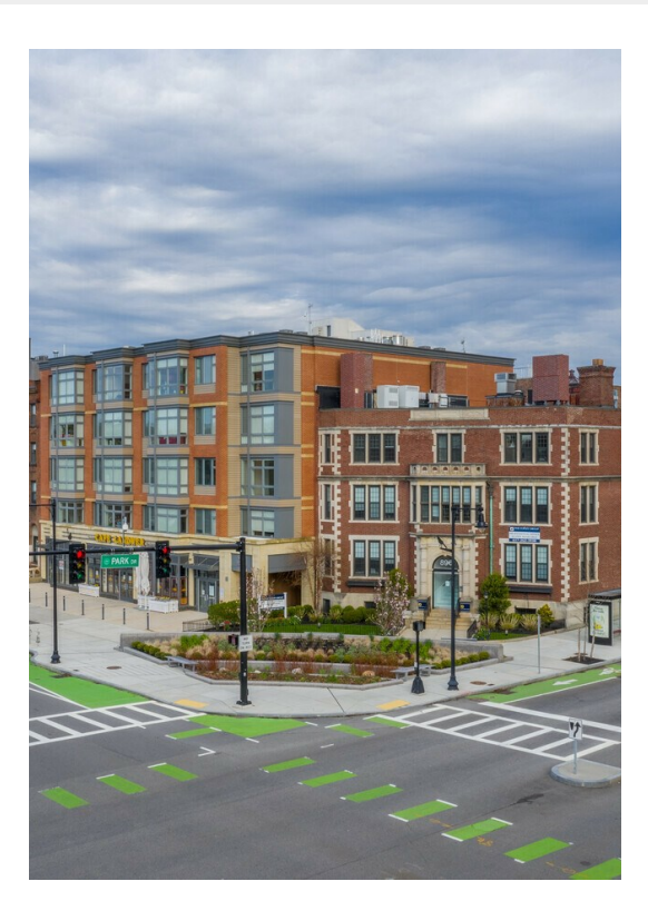
896 Beacon St