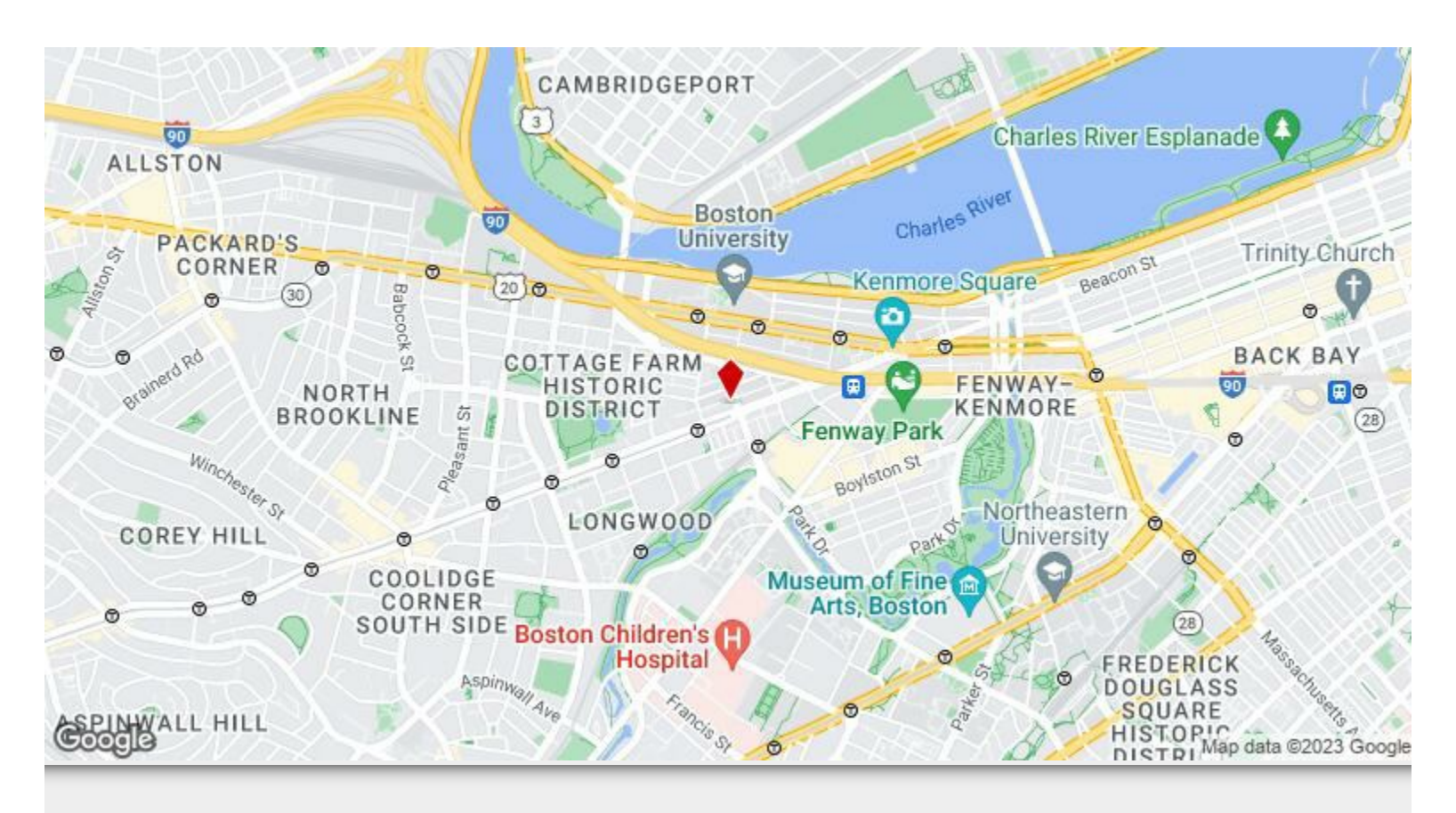
896 Beacon St, Boston, MA 02215

New renovation. Single office for lease. Includes reception area with waiting room, kitchen, conference room and private bathrooms.