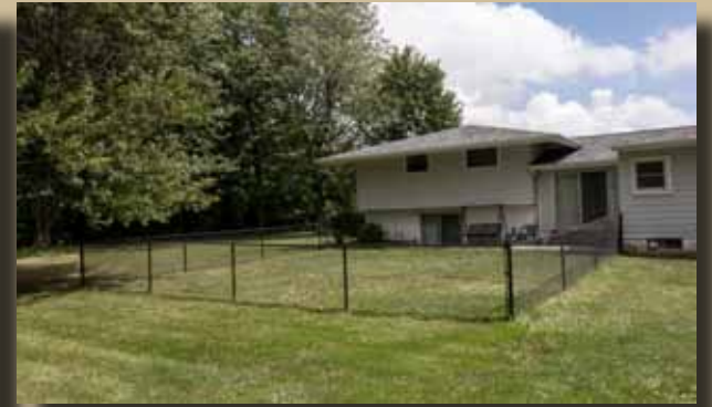
Rear Fenced Yard