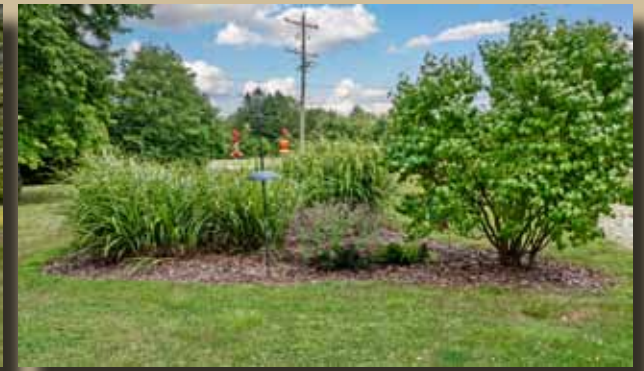
View of Landscaping