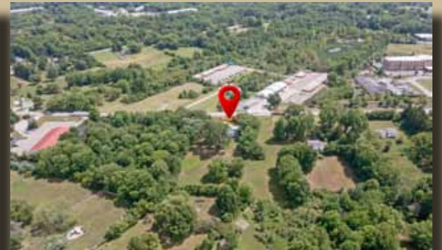
Aerial View of Neighborhood