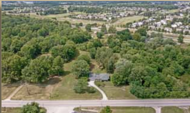
View of Wooded Lot