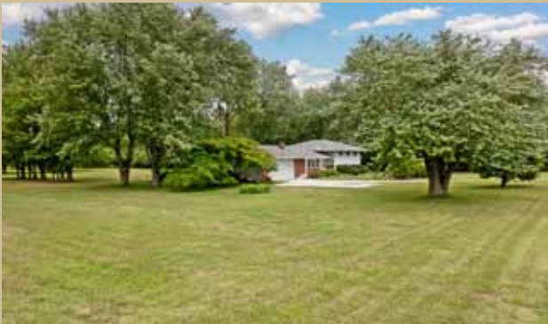
View of Front Yard