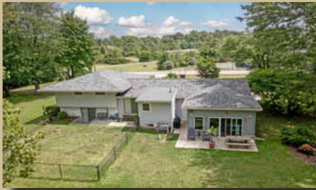
Rear Exterior View