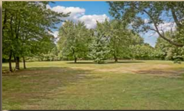
View of Rear Yard