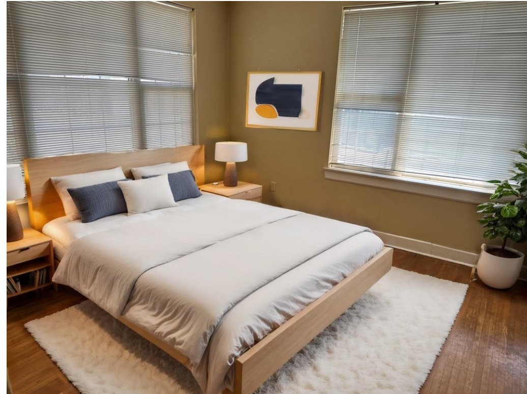
Photos are virtually staged