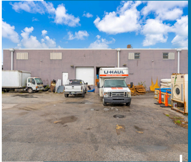
Enclosed Gated Area