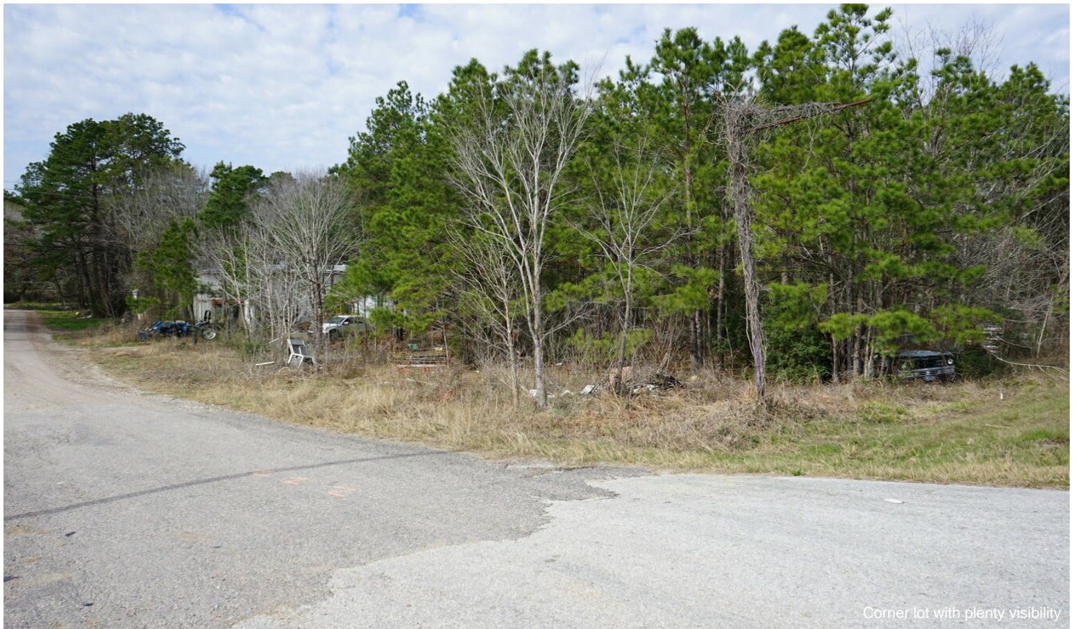
Corner lot with plenty visibility