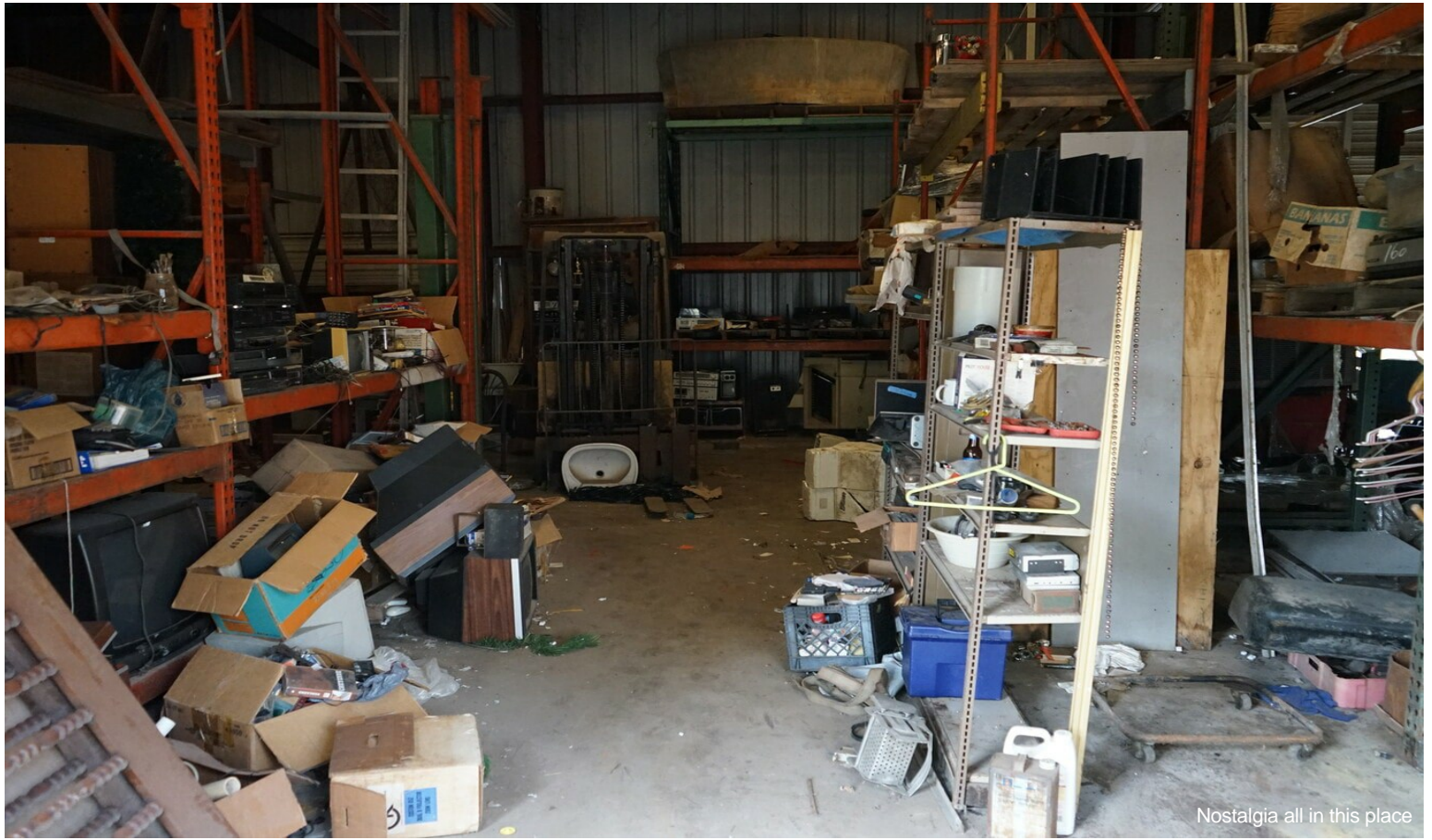
Nostalgia all in this place