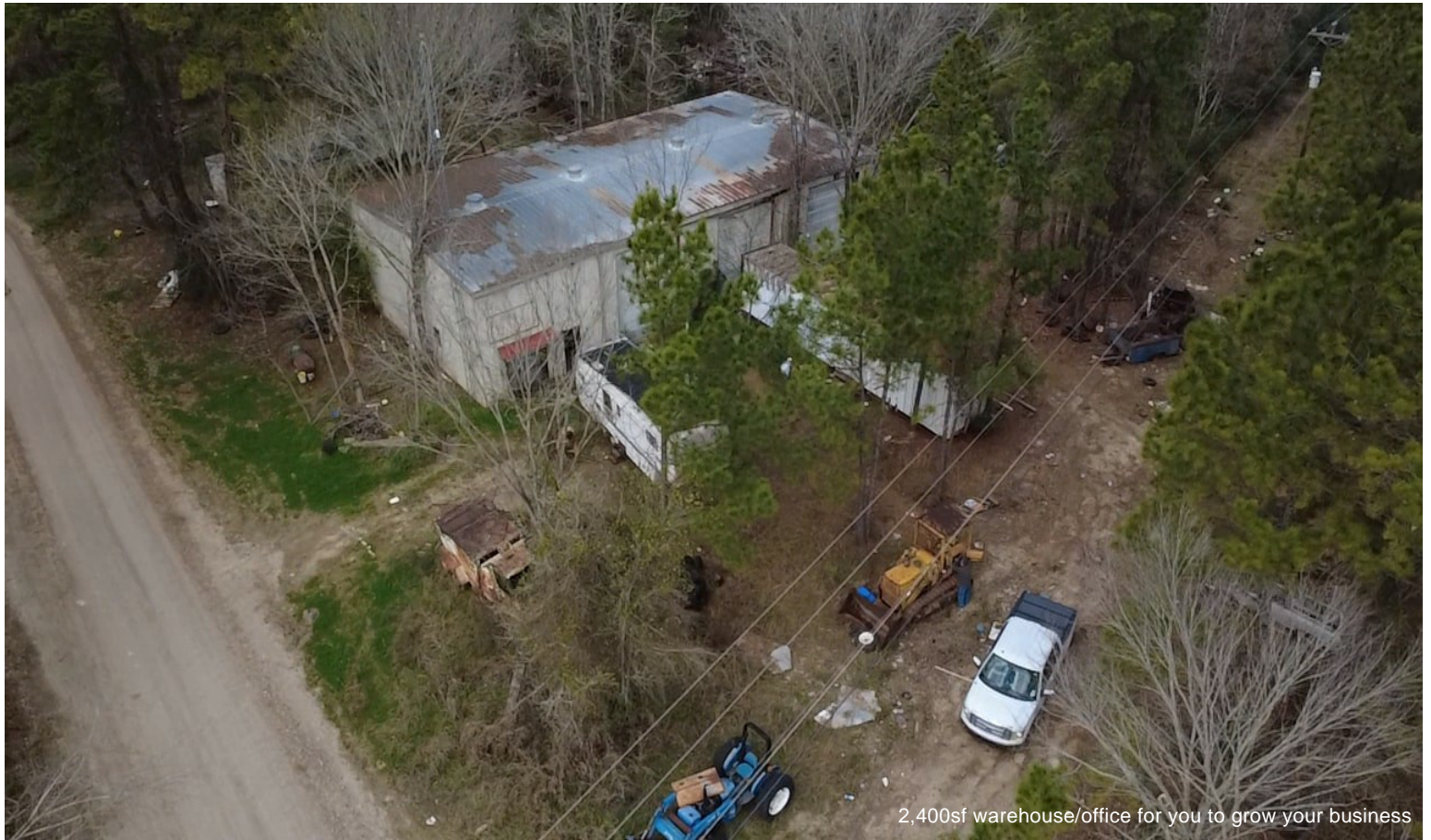
2,400sf warehouse/office for you to grow your business