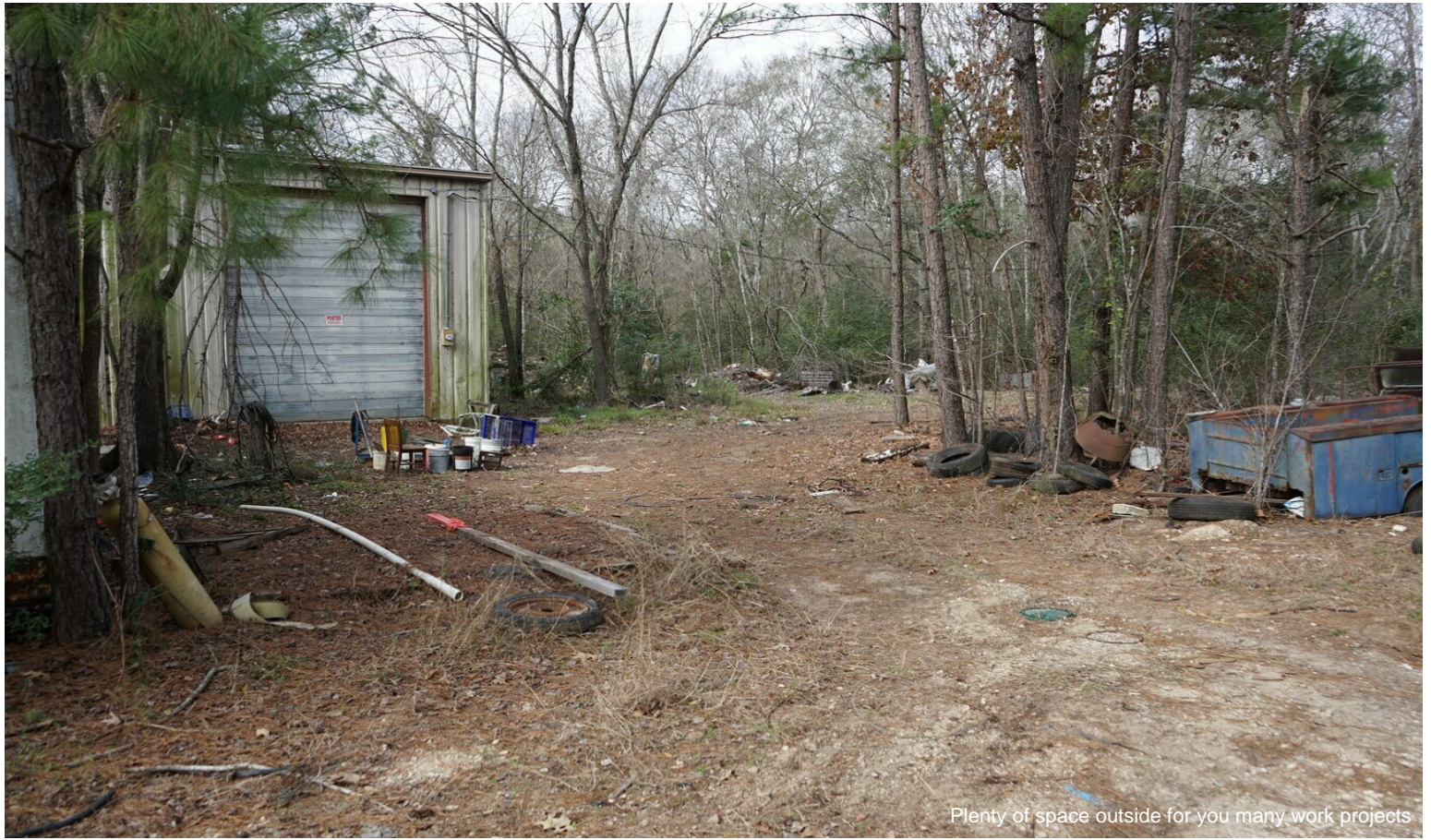
Plenty of space outside for you many work projects