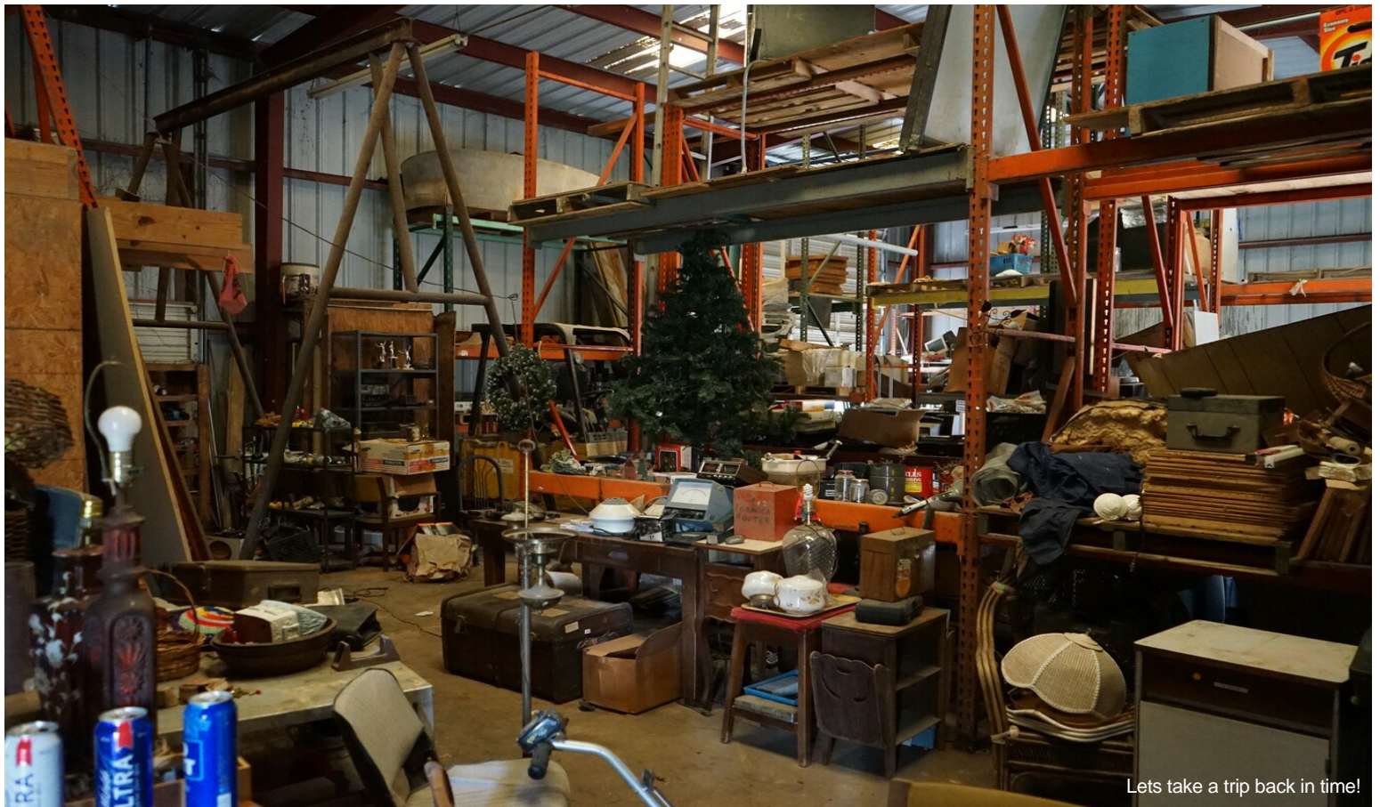
Lets take a trip back in time!