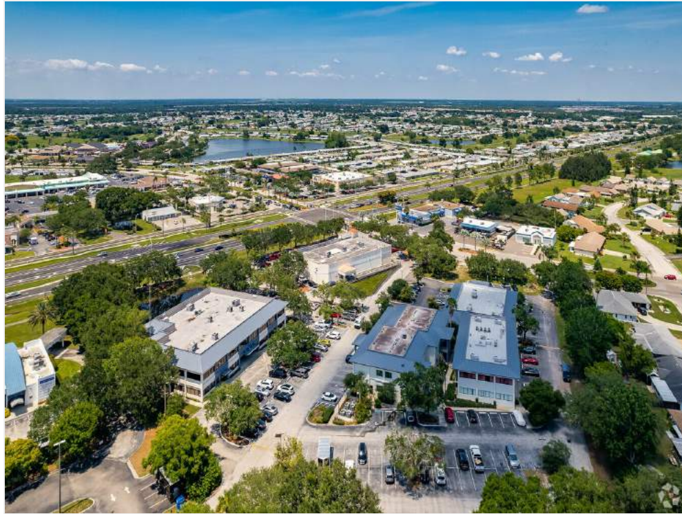
139 S Pebble Beach Blvd Sun City Center, FL