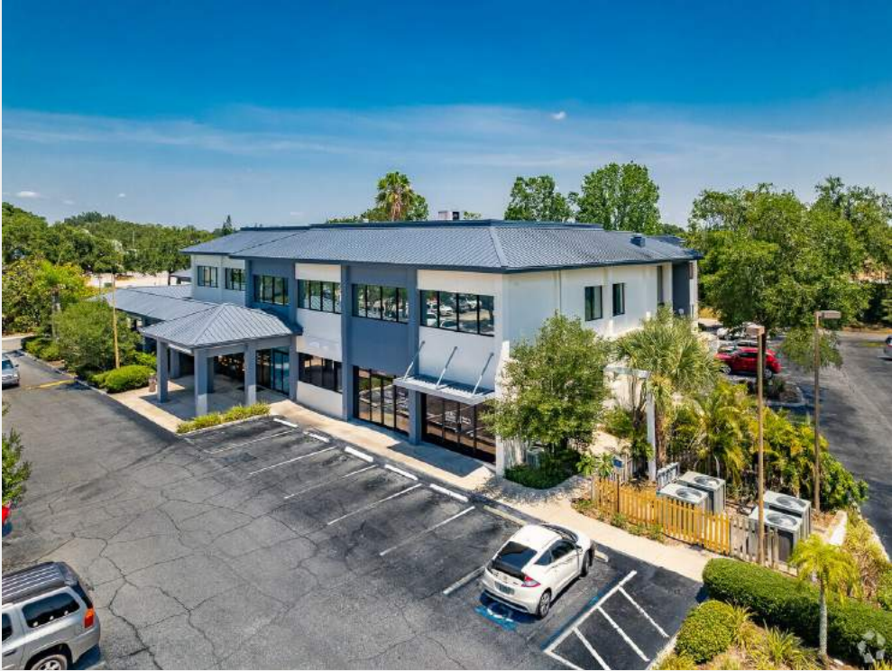
137 S Pebble Beach Blvd Sun City Center, FL