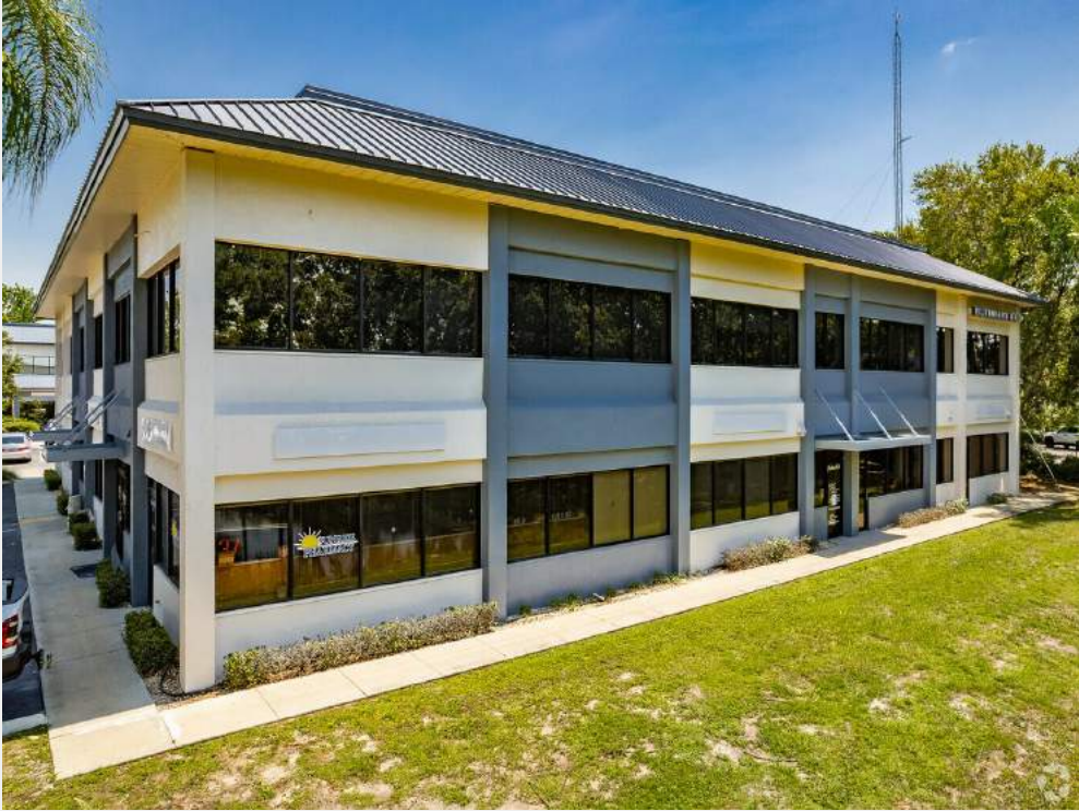
139 S Pebble Beach Blvd Sun City Center, FL