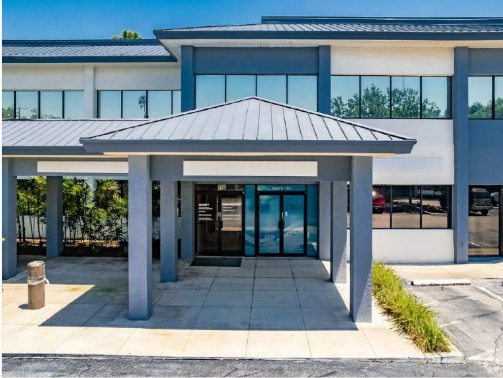
137 S Pebble Beach Blvd Sun City Center, FL