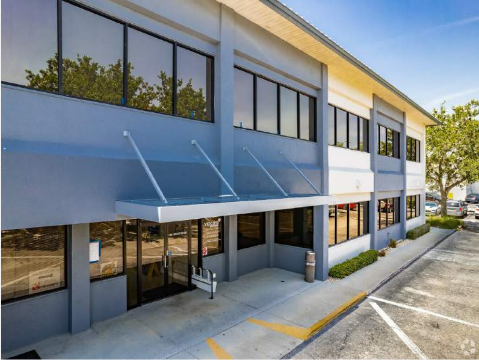
139 S Pebble Beach Blvd Sun City Center, FL