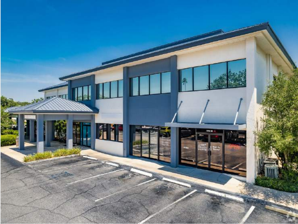
137 S Pebble Beach Blvd Sun City Center, FL