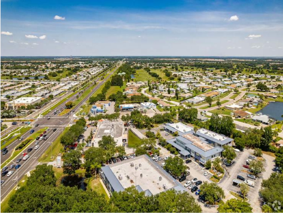
137 S Pebble Beach Blvd Sun City Center, FL