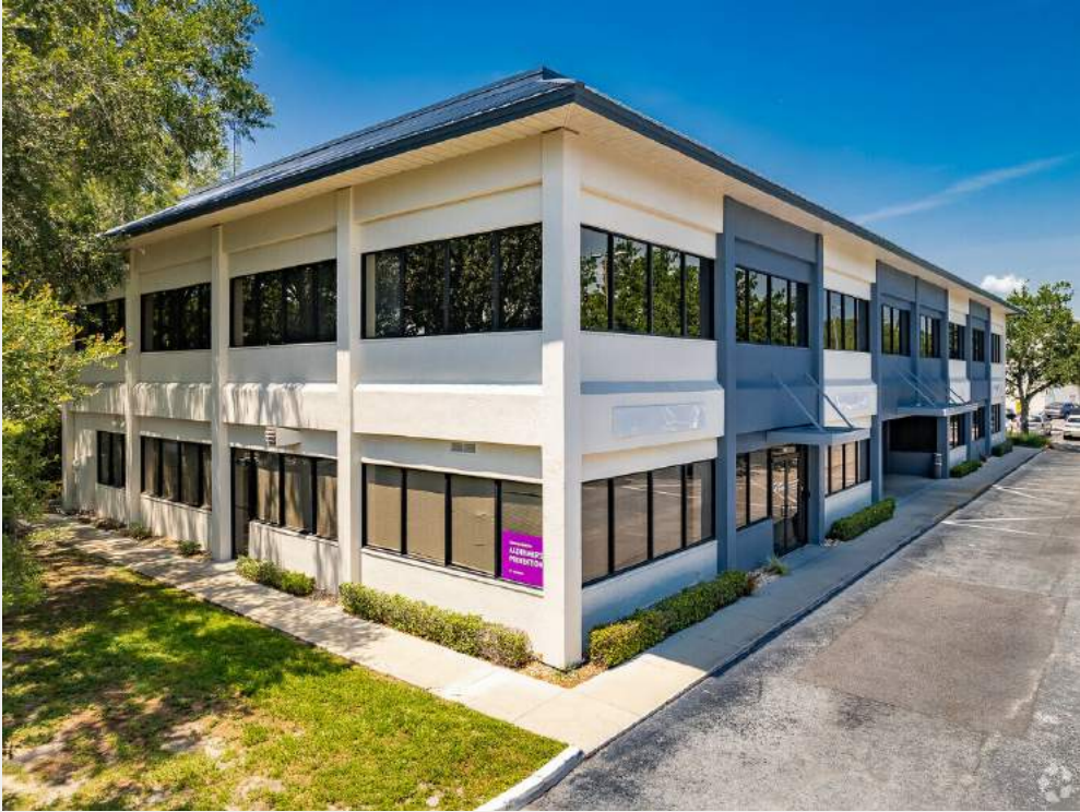
139 S Pebble Beach Blvd Sun City Center, FL