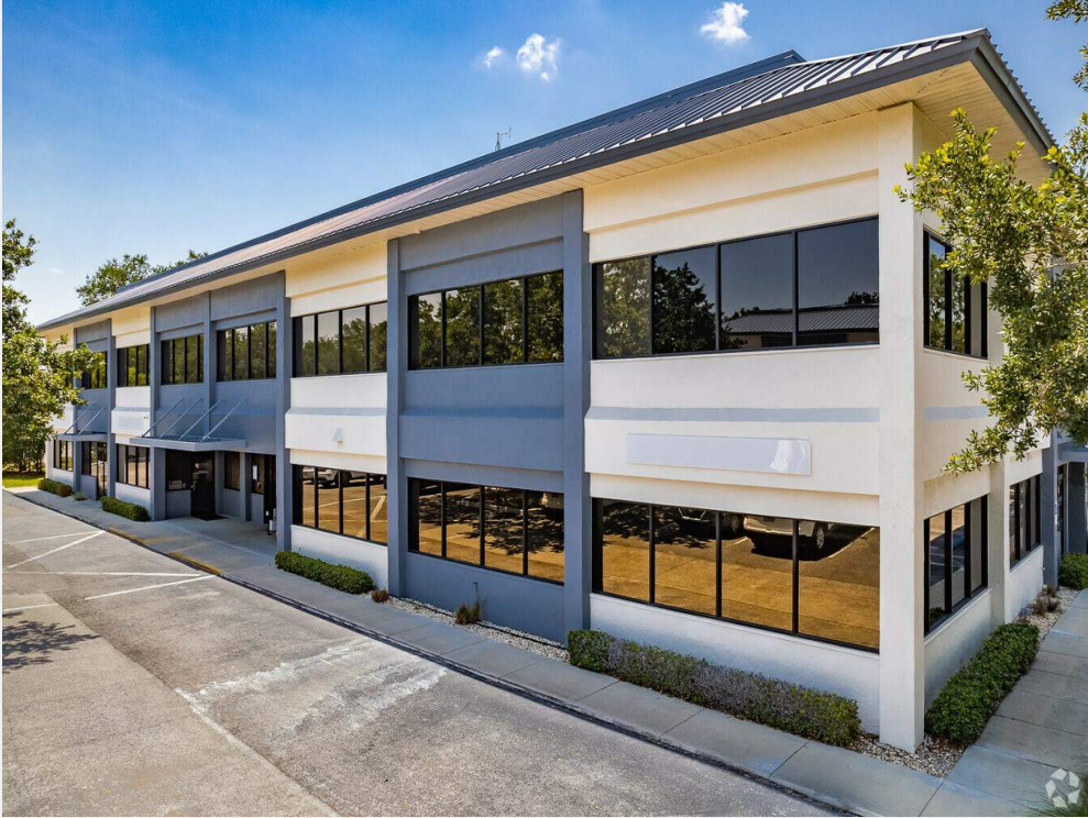
139 S Pebble Beach Blvd Sun City Center, FL