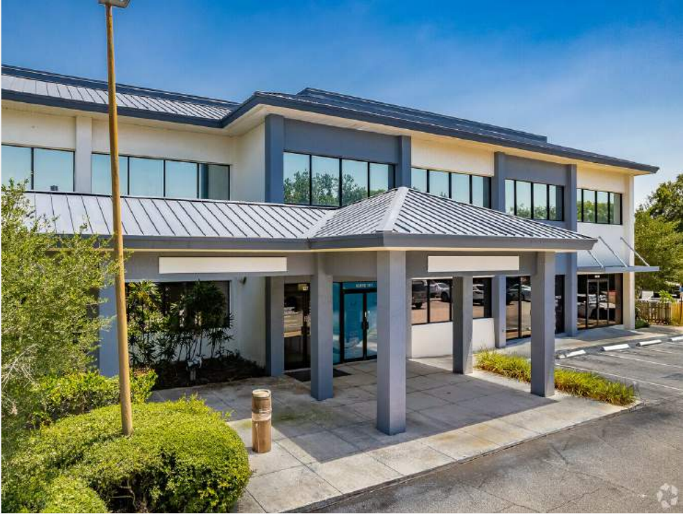
137 S Pebble Beach Blvd Sun City Center, FL