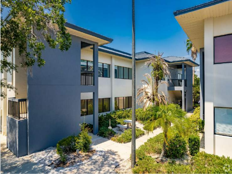
137 S Pebble Beach Blvd Sun City Center, FL