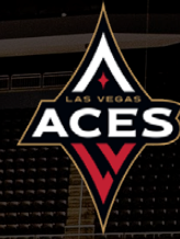
Las Vegas Aces

Relocated from Oakland in 2020, the NFL team plays at the state-of-the-art Allegiant Stadium, hosting both Raiders games and major events like the Super Bowl and concerts.