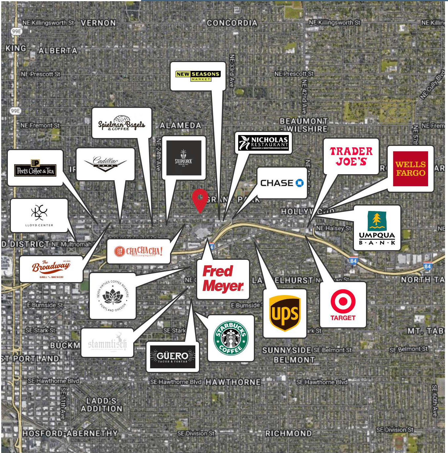
Map data ©2024 Google Imagery ©2024 Airbus, CNES / Airbus, Landsat / Copernicus, Maxar Technologies, Metro, Portland Oregon, USDA/FPAC/GEO

2931-2935 NE BROADWAY STREET, PORTLAND, OR 97232