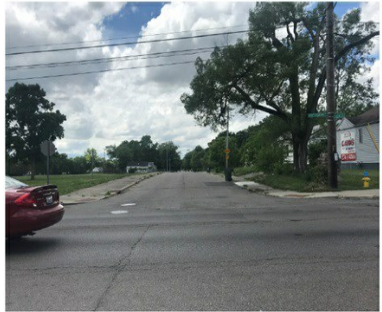
STREET SCENE LOOKING WEST ON QUEENS AVENUE