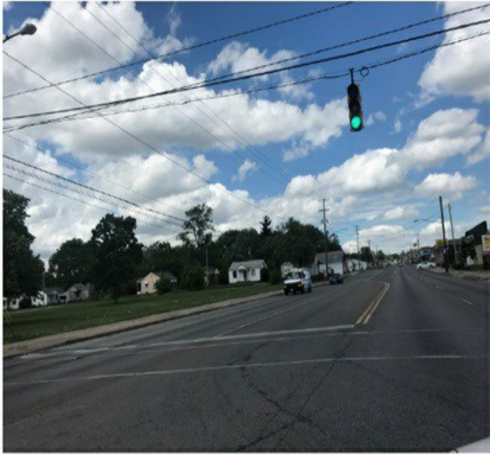
STREET SCENE LOOKING SOUTH GETTYSBURG AVENUE