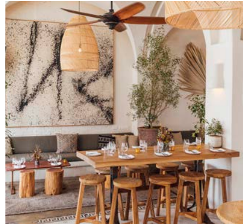
📍 GRAN BLANCO | 80 WINDWARD AVE