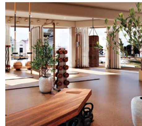
📍 HUME | 1600 MAIN ST