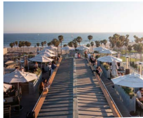
📍 HOTEL ERWIN | 1697 PACIFIC AVE