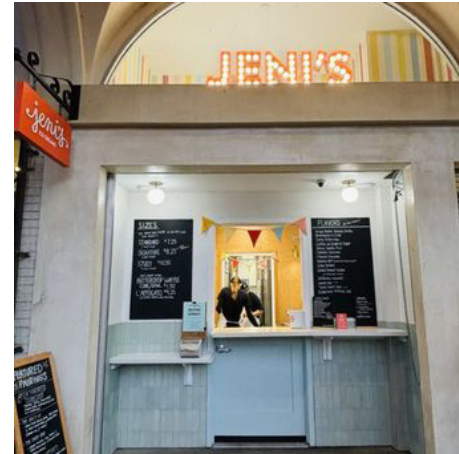
📍 JENI'S ICECREAM | 64 WINDWARD AVE