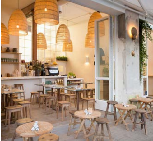
📍 GREAT WHITE | 1604 PACIFIC AVE