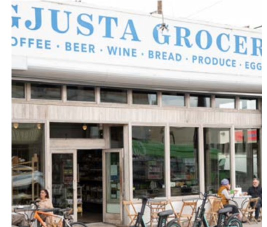
📍 GJUSTA GROCER | 105 WINDWARD AVE