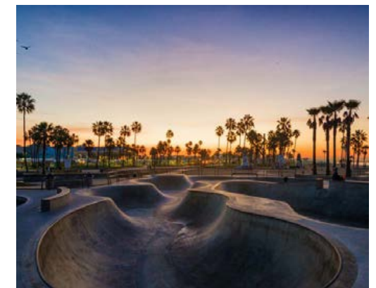
📍 VENICE SKATE | 1800 OCEAN FRONT WALK