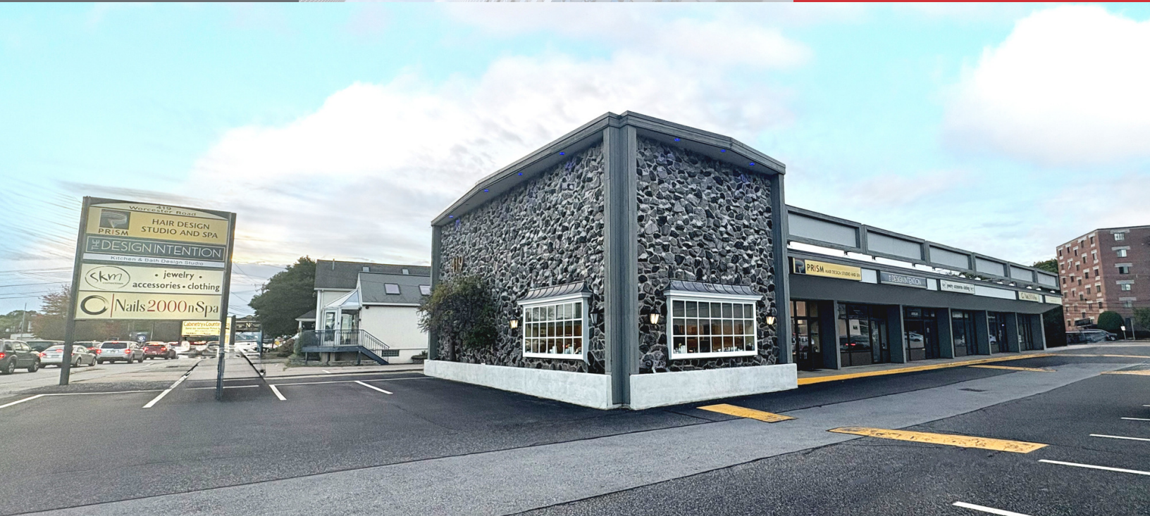
Frontage on Route 9 (Worcester Road) & Route 30 (Cochituate Road)