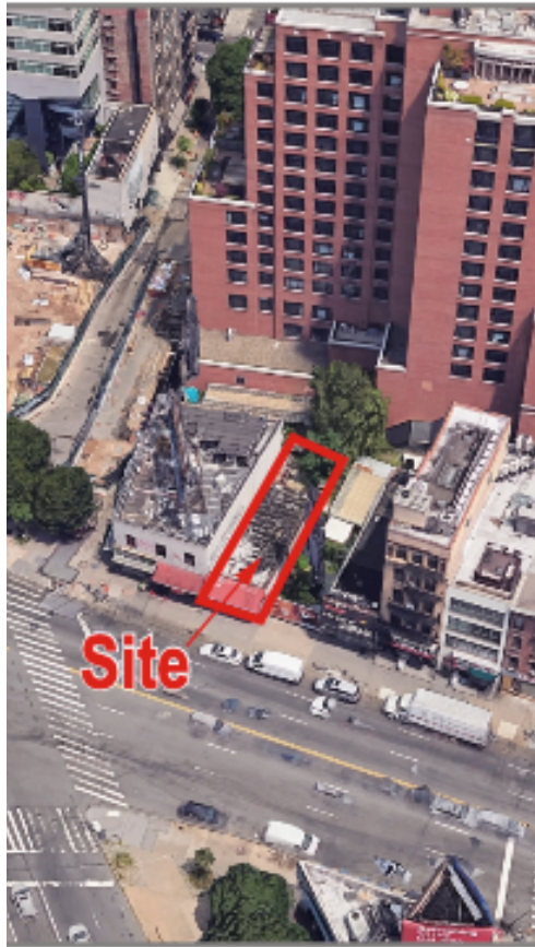
391 Canal - Aerial