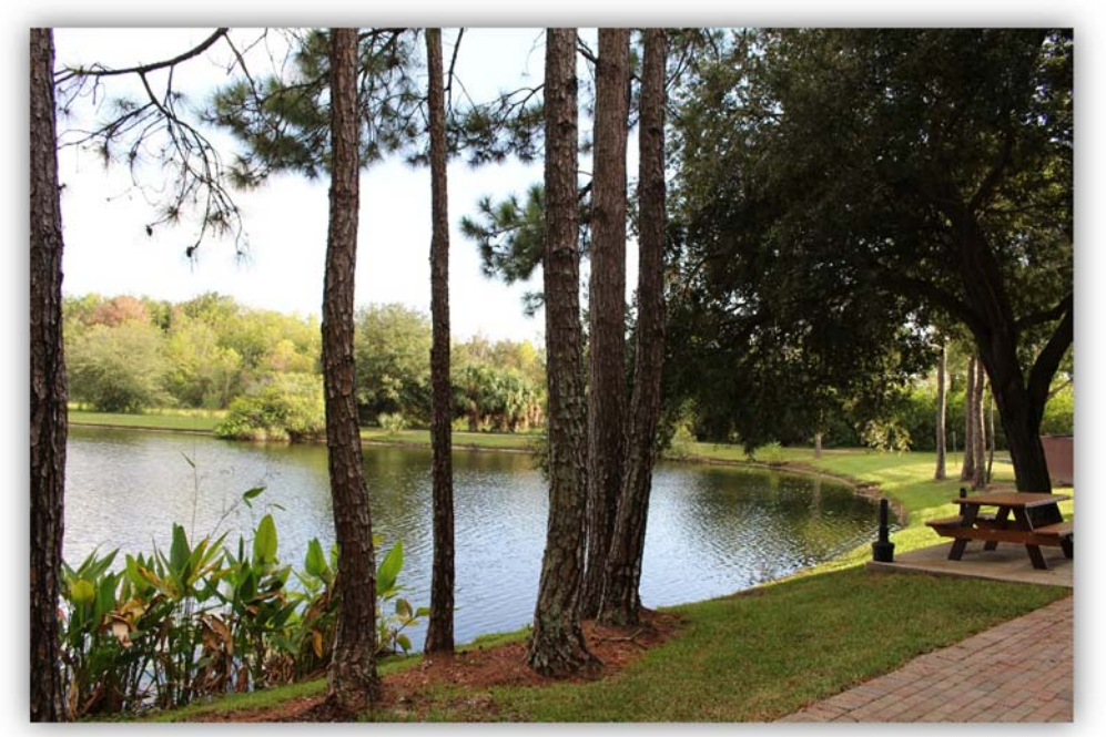
Walking trail around the lake with picnic tables.