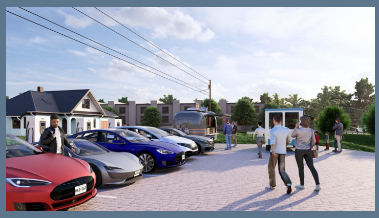
The Courtyard at Cockrell Pointe

The Courtyard at Cockrell Pointe is located directly adjacent to the Novello, a brand new 63 unit townhome and 3 condo hotel development priced in the $900s. These units will be available spring 2025. There are multiple other multi-family developments in the surrounding area: Trinity Summit with 25 units, Hampton Corner with 37 units. To the north of the property, a new southern style restaurant called Meridian Street Cafe is being developed.