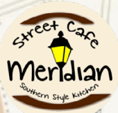
Meridian Street Cafe