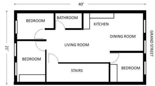
329 GRAND STREET 3/F, NEW YORK NY 10002