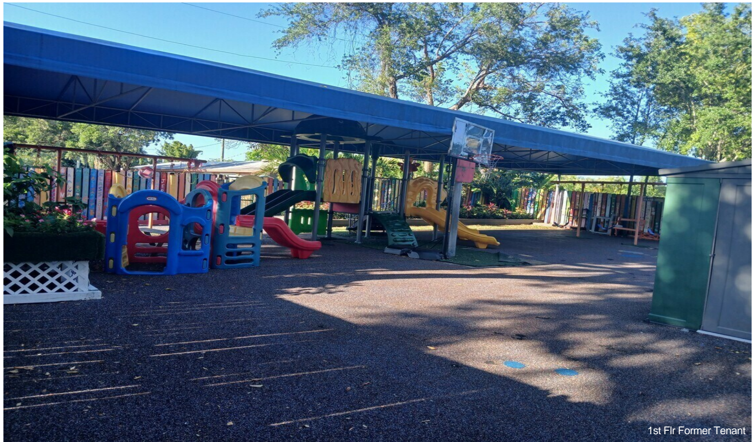
1st Flr Former Tenant