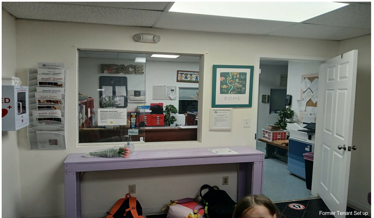
Former Tenant Set up