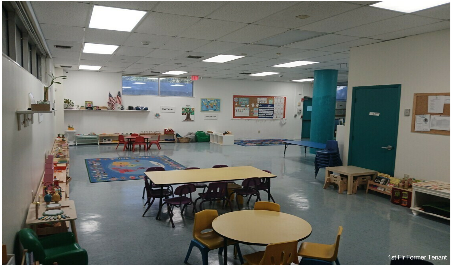
1st Flr Former Tenant