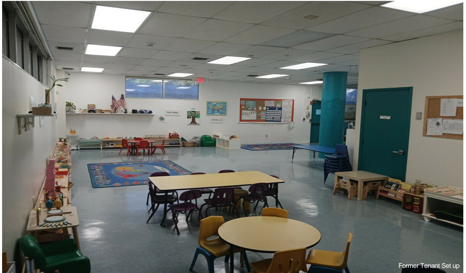
Former Tenant Set up