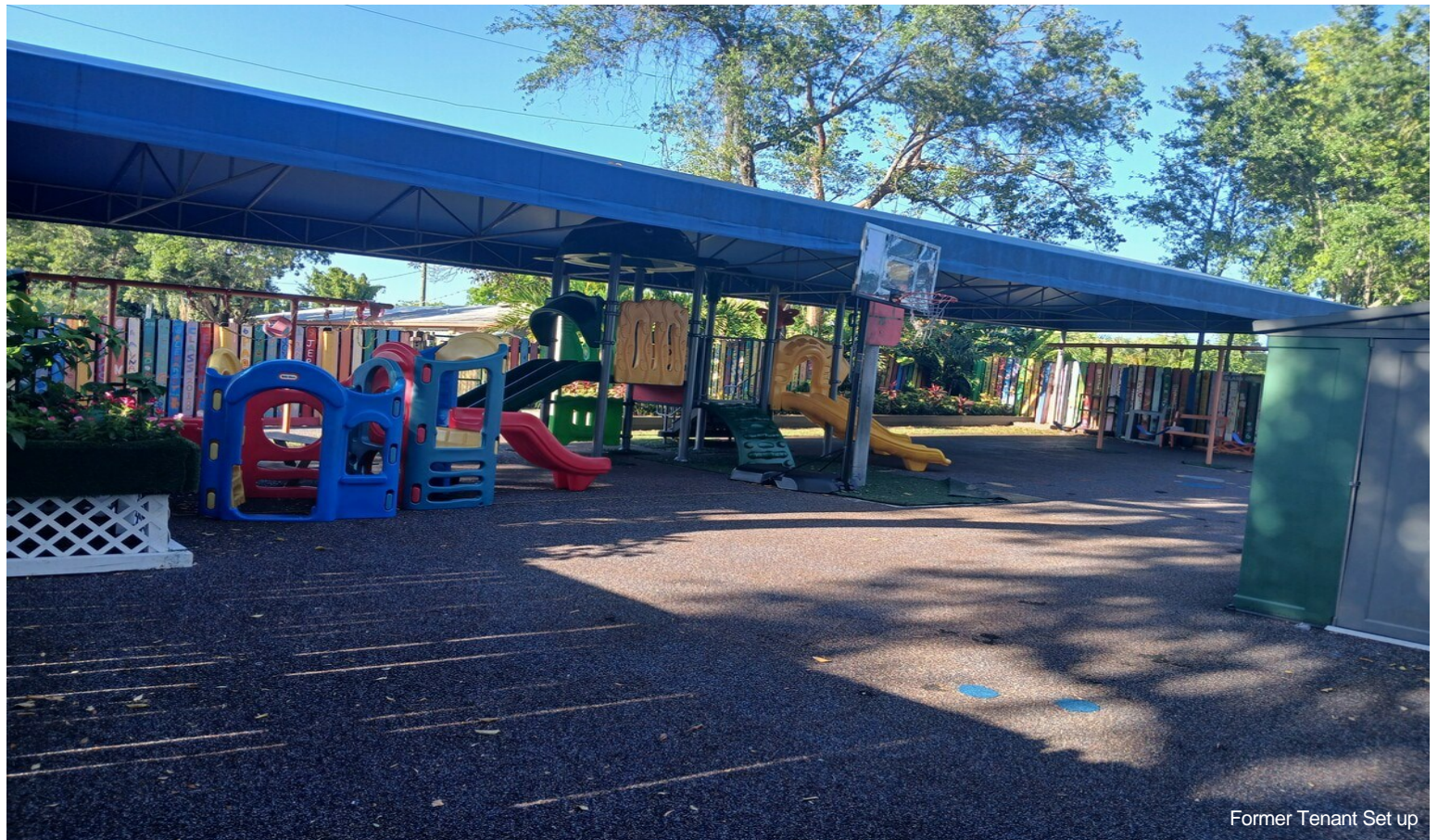
Former Tenant Set up