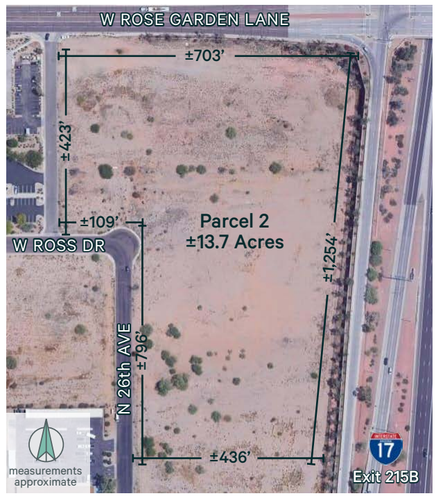
[1] By population. United States Census Bureau

© 2023 CBRE, Inc. All rights reserved. This information has been obtained from sources believed reliable, but has not been verified for accuracy or completeness. You should conduct a careful, independent investigation of the property and verify all information. Any reliance on this information is solely at your own risk. CBRE and the CBRE logo are service marks of CBRE, Inc. All other marks displayed on this document are the property of their respective owners, and the use of such logos does not imply any affiliation with or endorsement of CBRE. Photos herein are the property of their respective owners. Use of these images without the express written consent of the owner is prohibited.