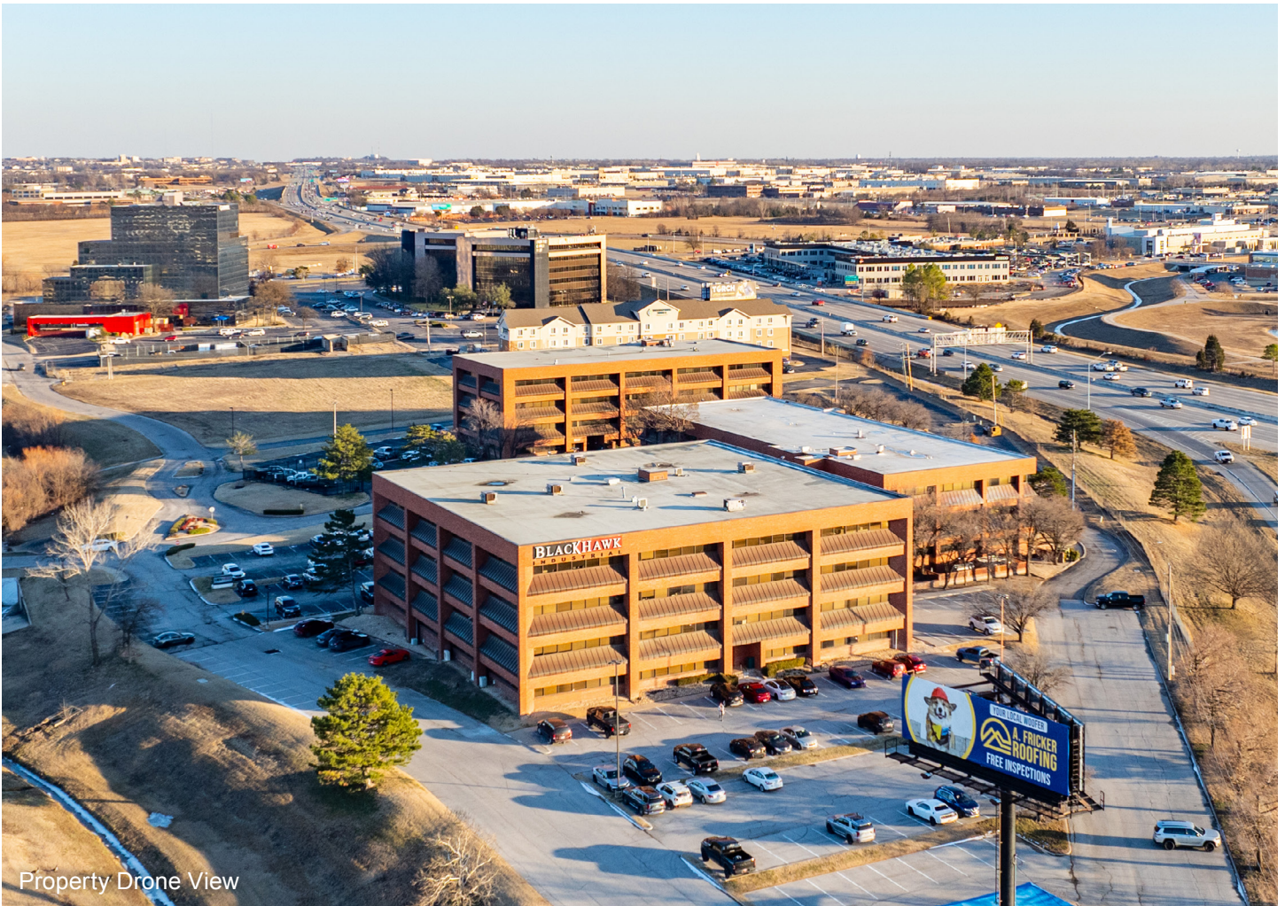
Property Drone View