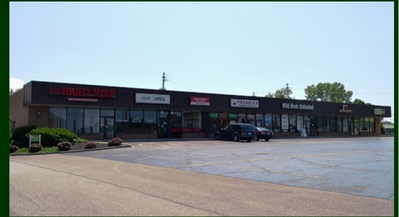
34500 Euclid Ave., Willoughby, OH

No warranty or representation, express or implied, is made as to the accuracy of the information contained herein. It is submitted subject to errors, omissions, price changes, rental or other conditions, withdrawal without notice, and to any special listing conditions imposed by our client.