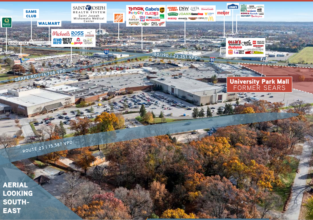
AERIAL LOOKING SOUTH- EAST