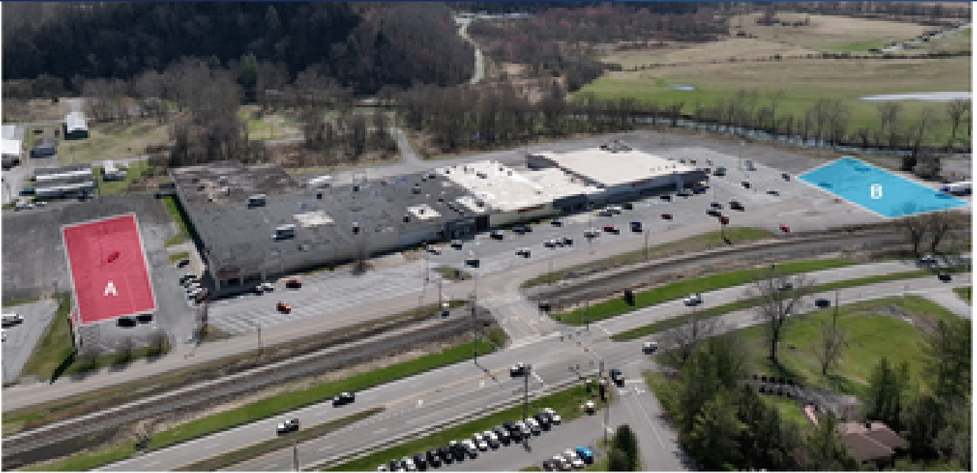
This diagram is intended to serve as an aid in graphic representation only. This information is not warranted for accuracy.