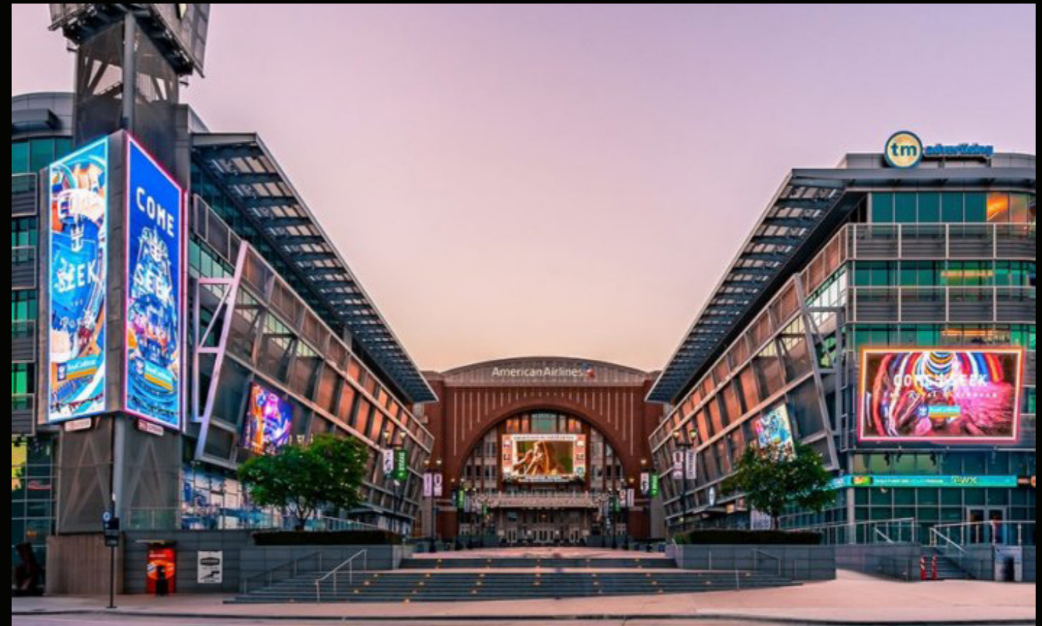
BLOCKS FROM VICTORY PARK