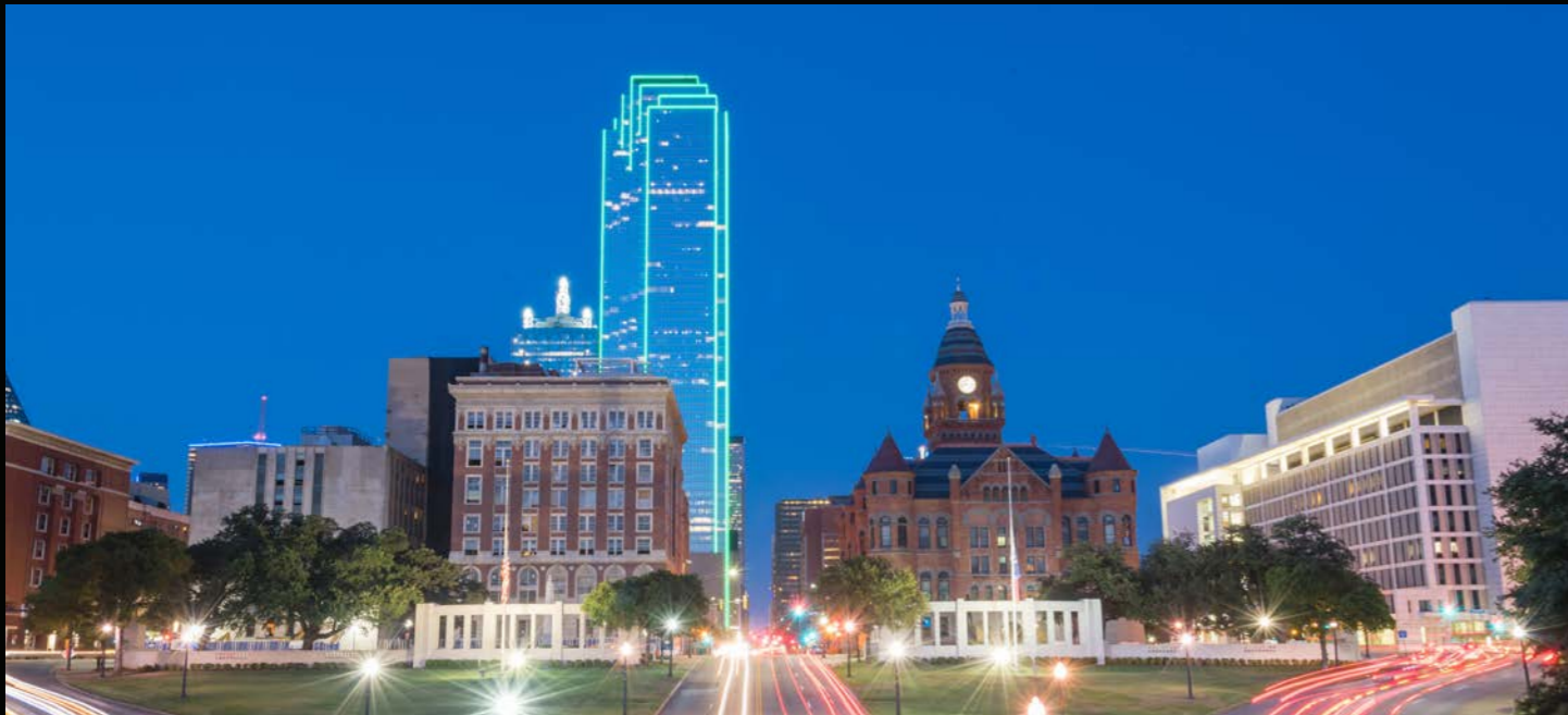
WALKABLE TO DOWNTOWN DALLAS