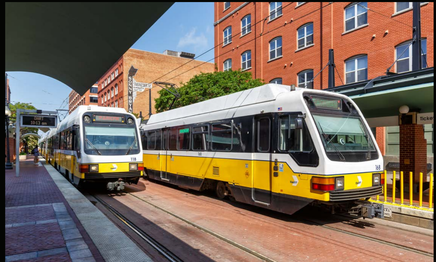
EASY DART ACCESS