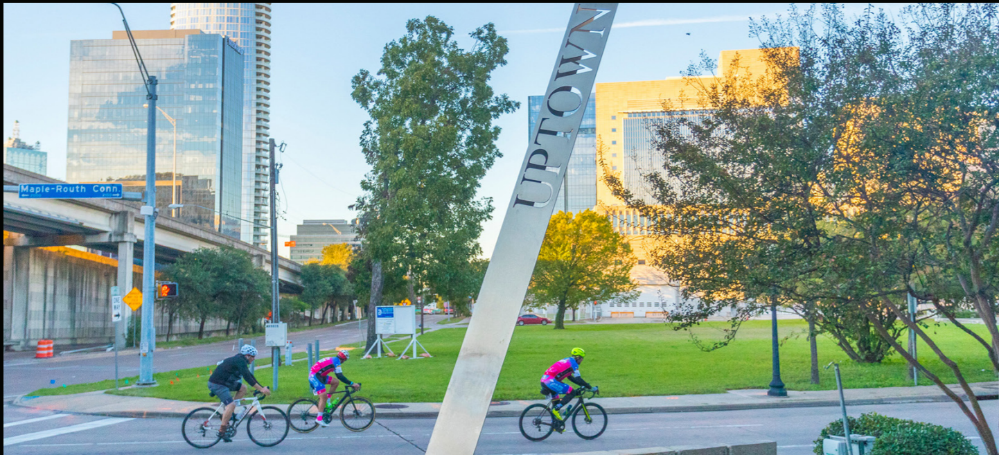
MINUTES FROM UPTOWN