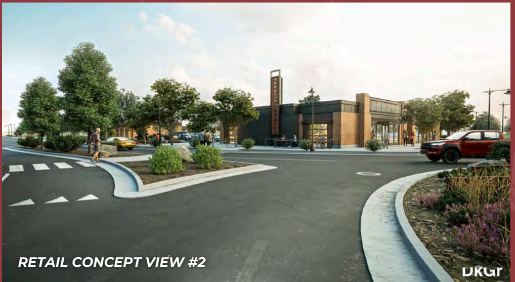
RETAIL CONCEPT VIEW #2