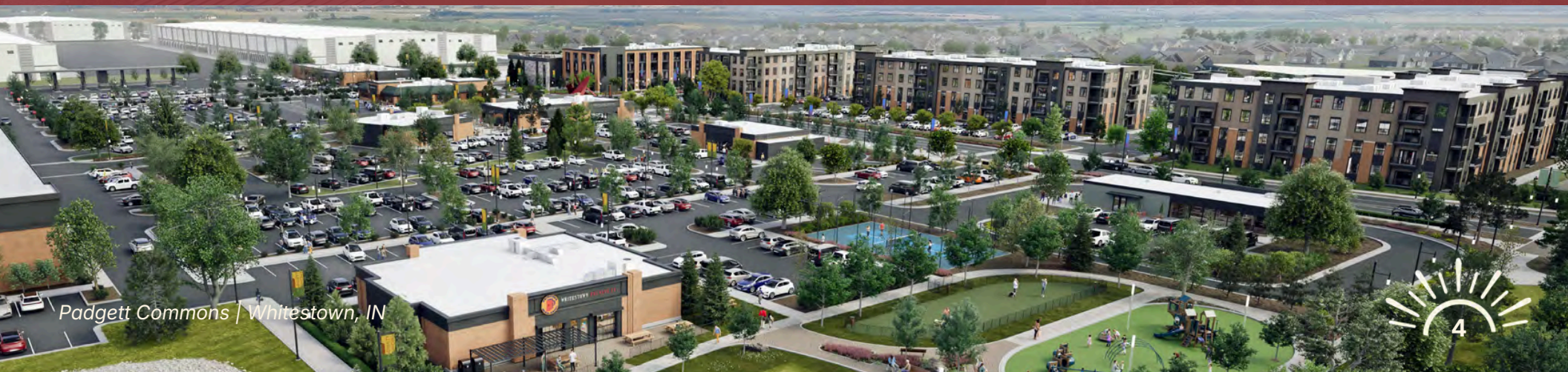
Padgett Commons | Whitestown, IN