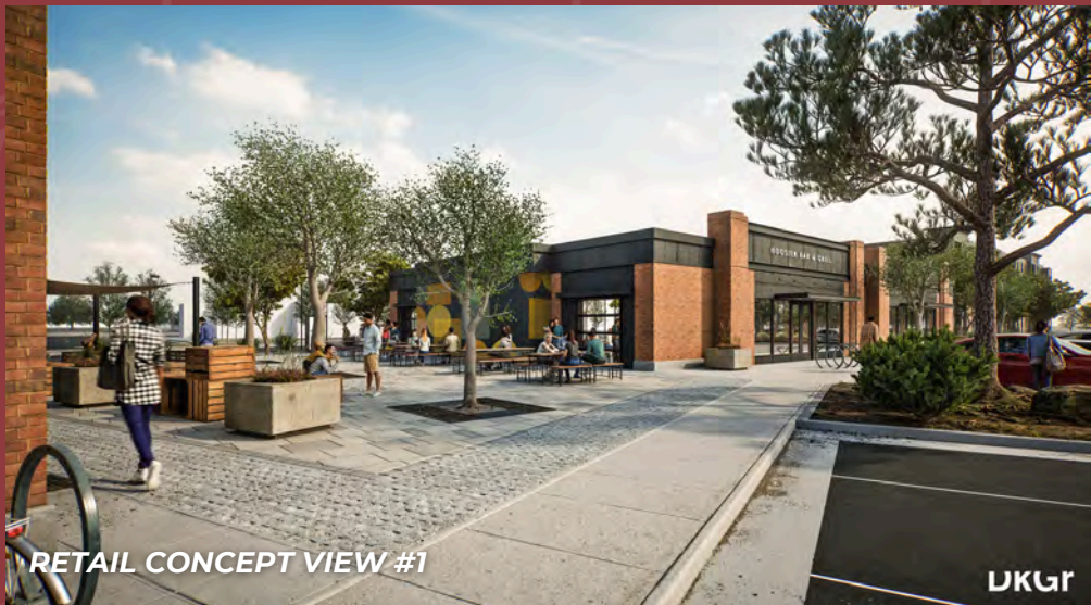
RETAIL CONCEPT VIEW #1