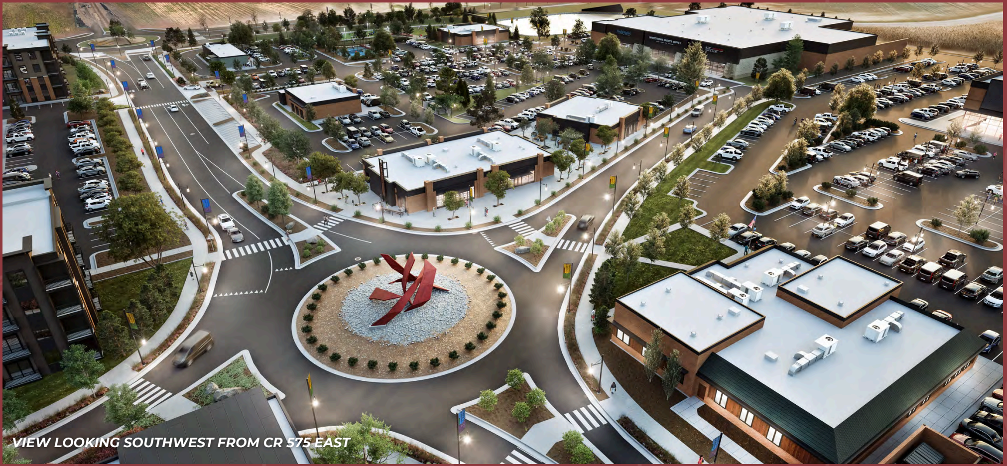
VIEW LOOKING SOUTHWEST FROM CR 575 EAST