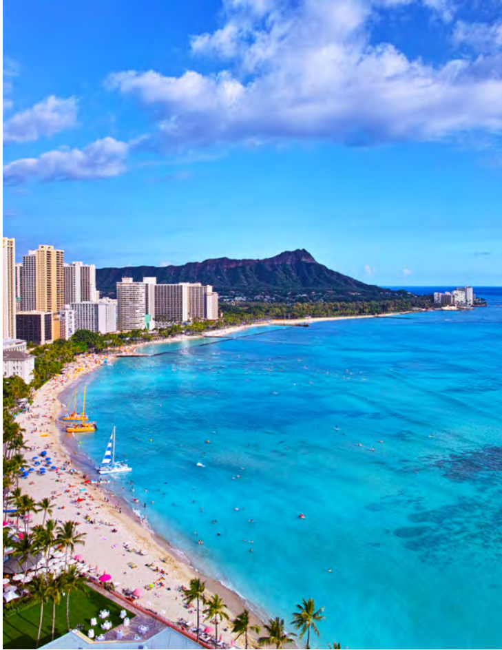
Waikiki | Honolulu | Oahu | Hawaii

Waikiki is Honolulu's premier "urban retail" market, and one of the foremost travel/resort and shopping destinations in the world. A total of 25 city blocks long and four blocks wide, the total land area is approximately 485 acres. To the south, Waikiki is bordered by the beach and ocean and to the north, the Ala Wai Canal. Two major landmarks bound Waikiki on the east and west sides. To the east is Diamond Head Crater and to the west, Ala Moana Center. In terms of gross sales and rents for markets in the United States, Kalakaua Avenue is one of the top seven resort retail markets in the United States. Kalakaua Avenue compares to Rodeo Drive and Robertson Boulevard (Los Angeles), Madison Avenue and 5th Avenue (New York City), Union Square (San Francisco), The Magnificent Mile - North Michigan Avenue (Chicago), and Lincoln Avenue (Miami).