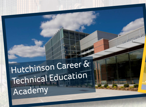
Hutchinson Career & Technical Education Academy