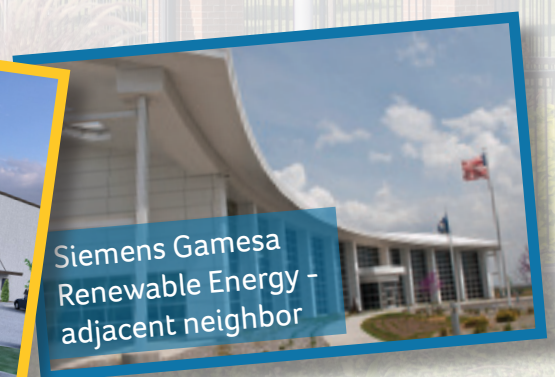
Siemens Gamesa Renewable Energy - adjacent neighbor