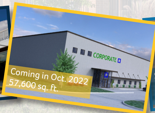
Coming in Oct. 2022 57,600 sq. ft.