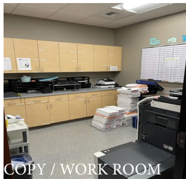
COPY / WORK ROOM