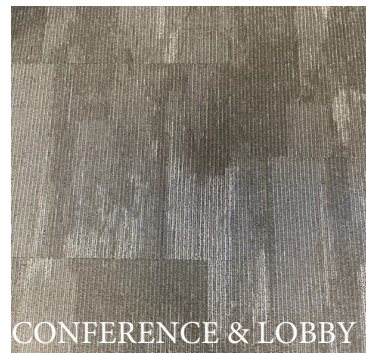
CONFERENCE & LOBBY