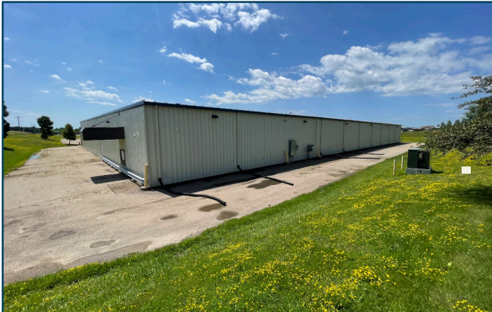
Drive Thru Facing Hwy 65