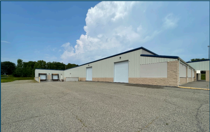
Western Facing Loading Dock and Drive In Doors